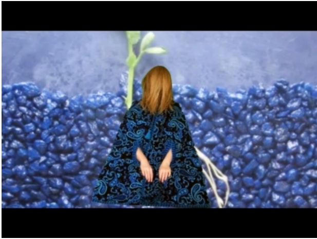
Radical Man: an ode to radicalism, 2017 Video installation