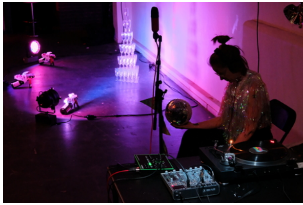
Diamond DJ 10 years later, 2019 performance