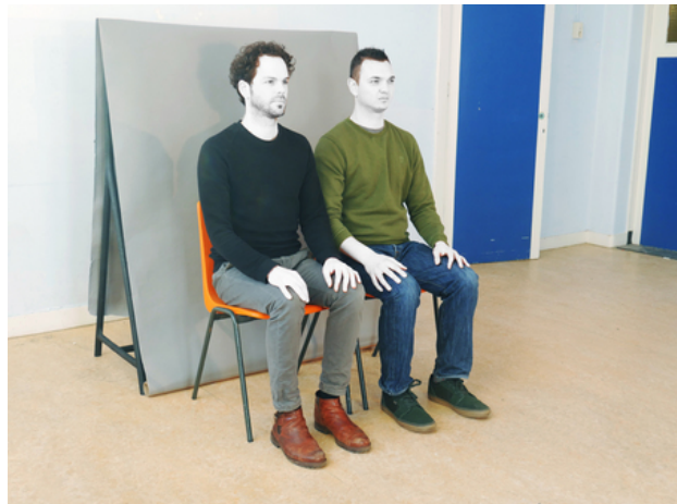
Alkaloid, 2019 photo