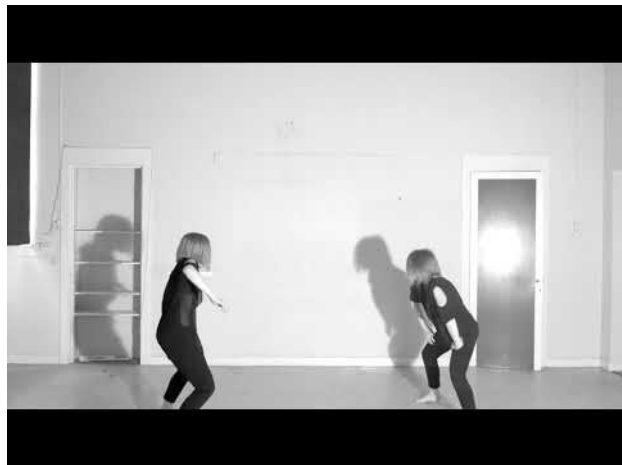
SPLIT, 2019 6