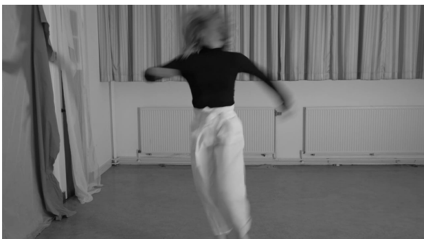
SPIN, 2019 5