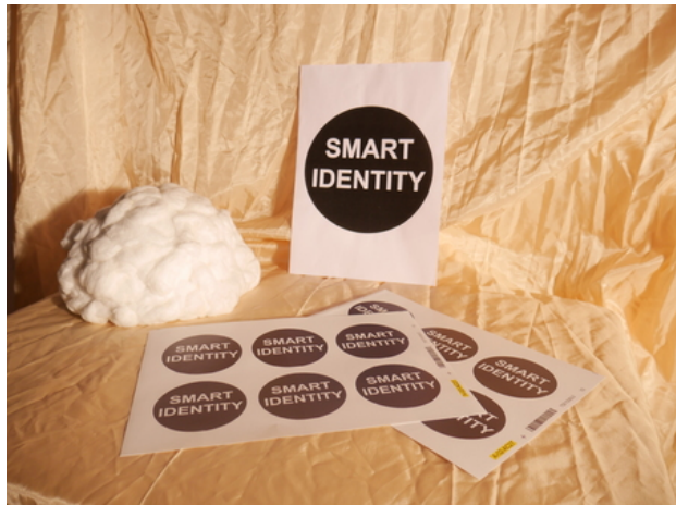
The internet of identities, 2018 interactive performance