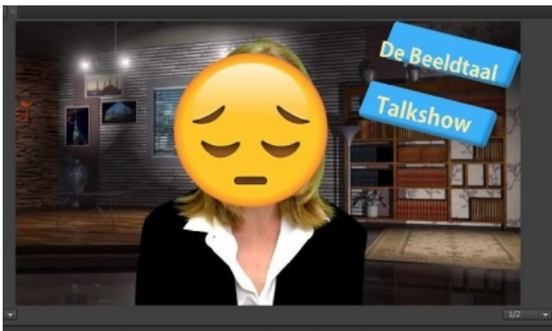
De Beeldtaal talkshow, 2017 Video installation