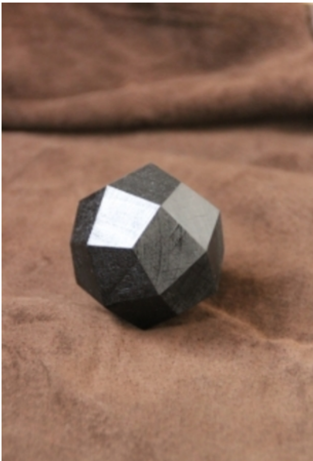
Deltoidalicositetrahedron, 2013 hout, 5cm.