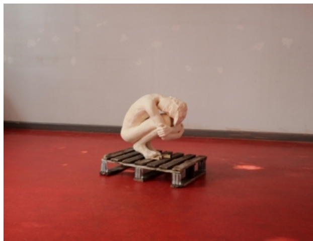
geen titel, 2014 keramiek, 70cm. x 65cm. x 50cm.