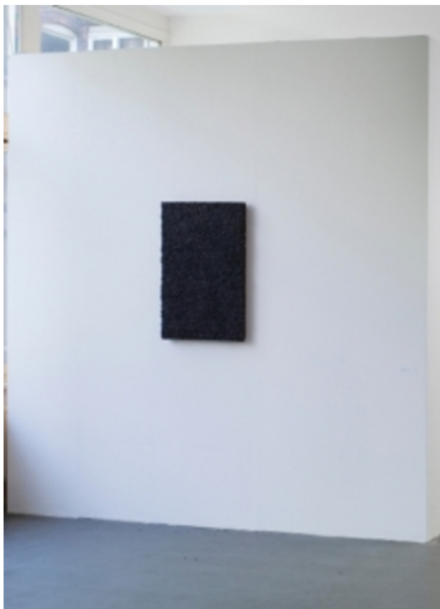
Bitumen, 2012 Asfalt, 85cm. x 56cm.