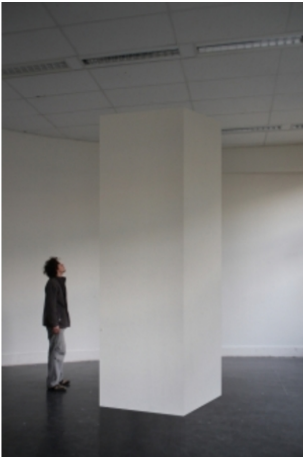
Sequence, 2014 polystyreen, 370cm. x 125cm. x 125cm.