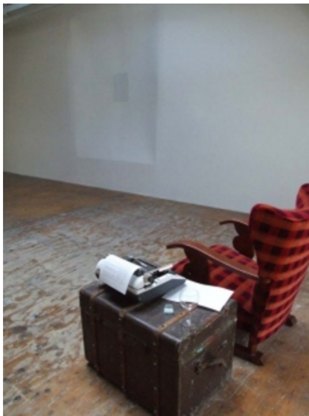
Luisteren naar je gedachten, 2011 verschillende materialen, ruimte vullend