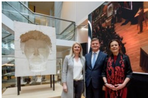
Rosalind Franklin, 2017 gips, 100 x 100 x 250