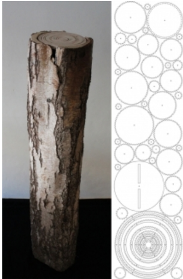
clockwise nature, 2013 gemengde technieken, 170cm. x 29cm.