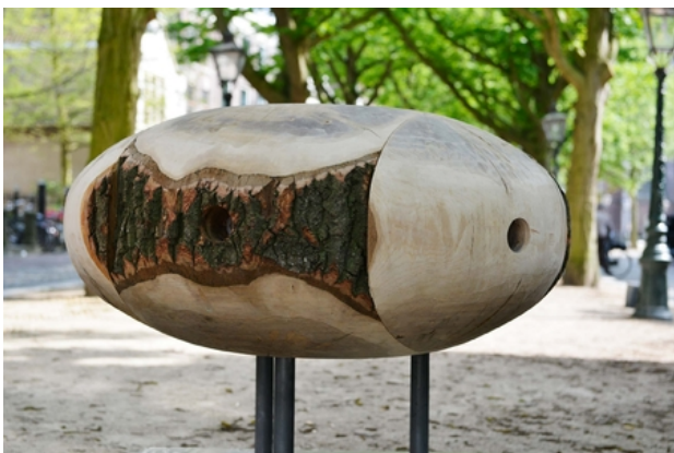
Descendant, 2015 woodcarving, 120 x 120 x 100