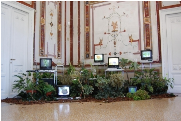
Post Human Garden, 2011