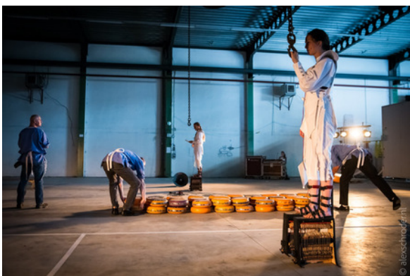
Magnetoceptia - Tip The Scales in a Gambler's Favor, 2017 Mixed media, performance