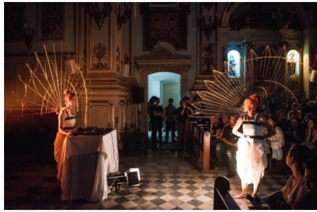
Magnetoceptia - Maria de' Medici and Maria Stuart, 2017 Mixed media, performance, 300x150x50