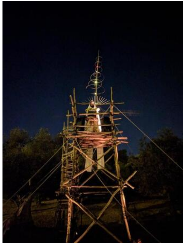
Magnetoceptia, The Signaller #CQ , 2017 Mixed media, performance