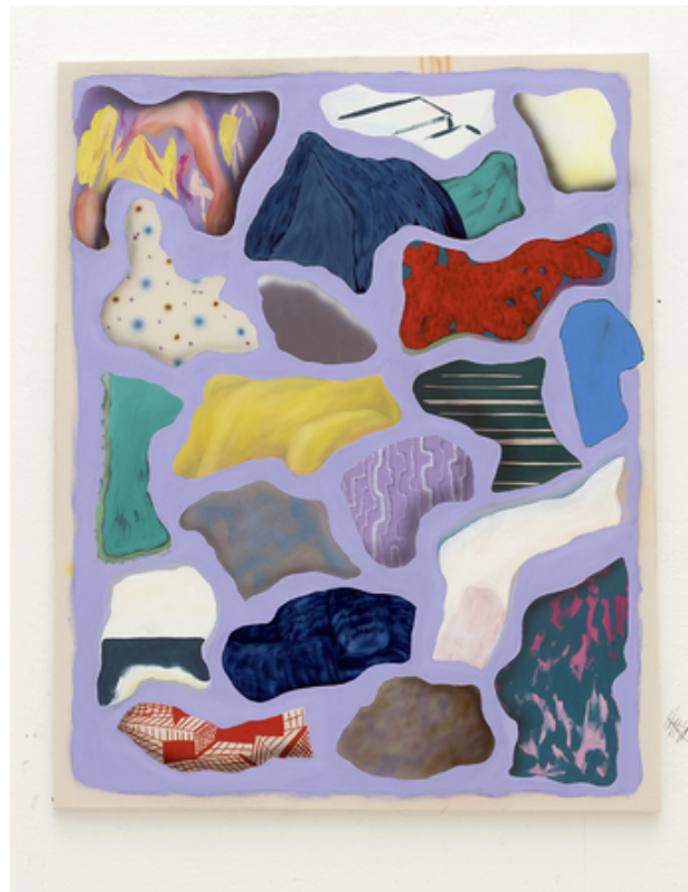
Play Doh's Cave , 2018 Oil and acrylics on canvas, 100 x 130 cm