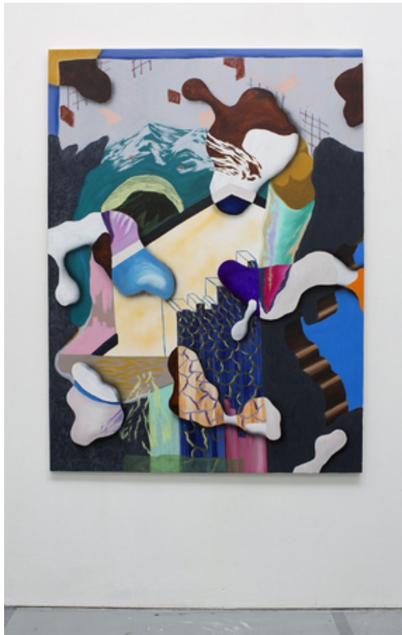
First we did molly, , 2018 Oil and acrylics on canvas, 115 x 160 cm