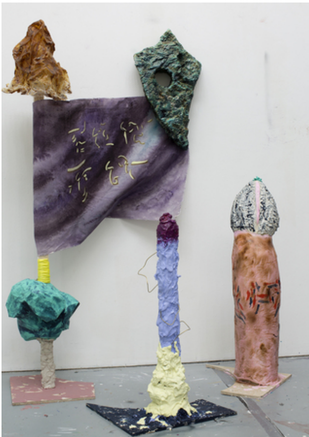
You're a fuckin' inanimate object! , 2019 Polystyrene, plaster, paper maché, latex rubber, cotton, acrylics, resin and wood, variable