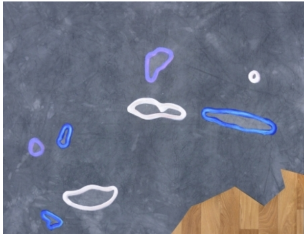
MTFBWY, 2016 oil and vinyl on pre-dyed canvas, 130x170 cm