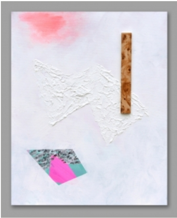
Why does it look so good but feel so bad, 2016 marble tile and acrylics on canvas, 40x50