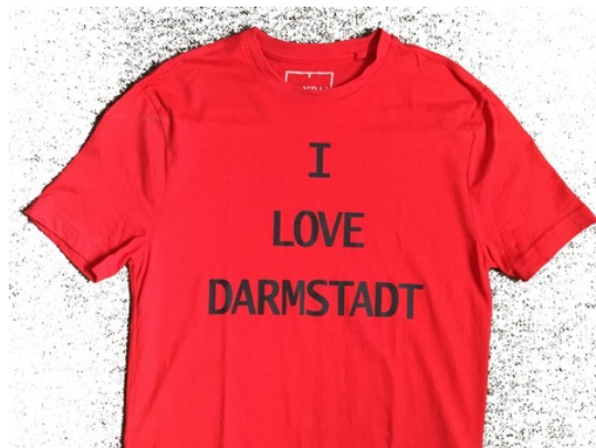
Darmstadt Hugging Music, 2016 performance