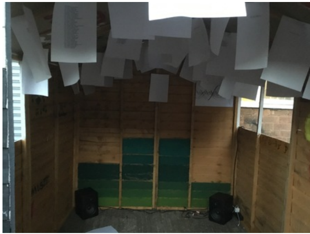
Females, 2018 installatie