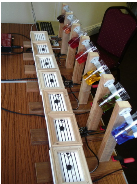
KlangfarbenTanz, 2018 performance, installation

2016 - Curator for Post-Paradise Concert 2019 series On-going