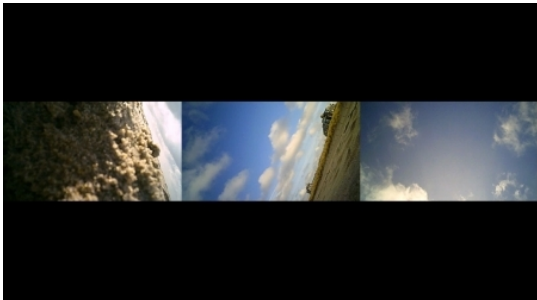
Memory Studies, 2017 performance, video