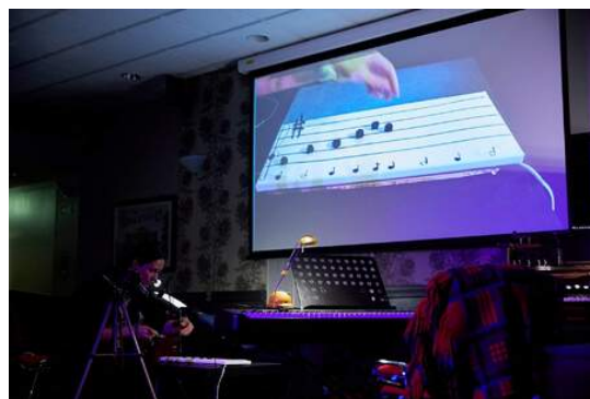
All English Music is Greensleeves - solo, 2018 Performance