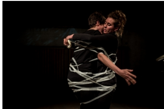
Tape Piece, 2017 performance