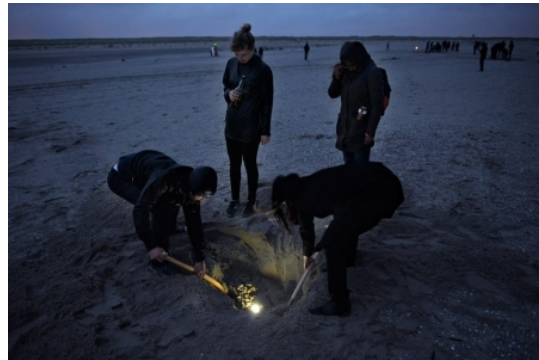
Sand Songs, 2016 installation