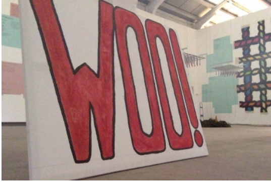
A Hard Day's Night, 2016 performance