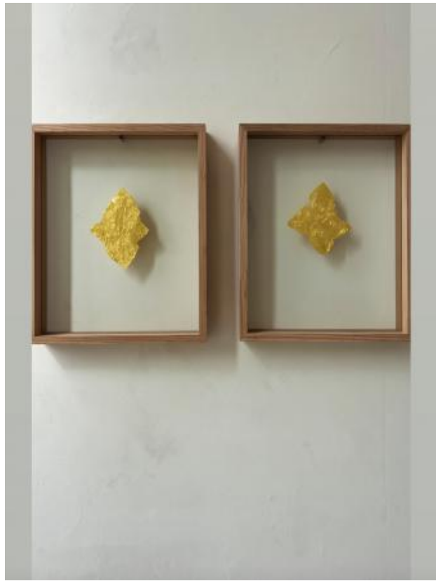
Becoming Form, 2025 24k gold, 25 x 20