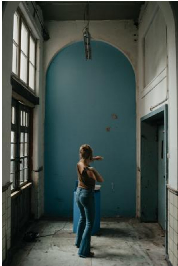
Cup Unfolding, 2023 Ceramics