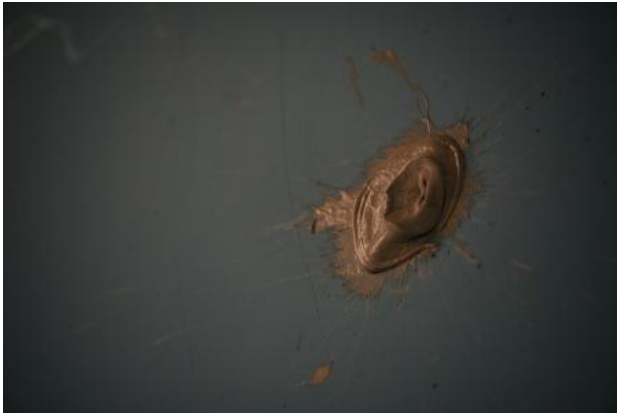
Cup Unfolding, 2023 Ceramics