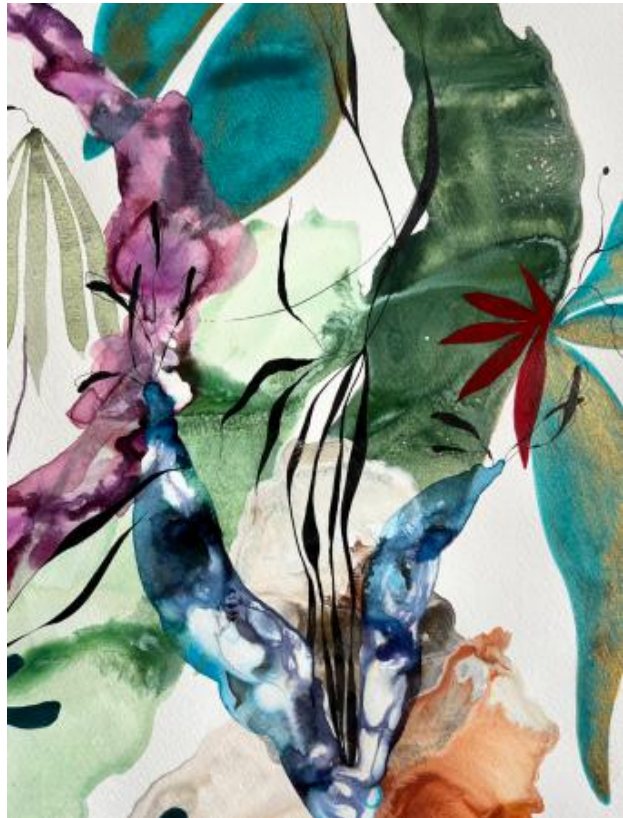
Endless Rhizome, 2025 Mixed, 76 x 56