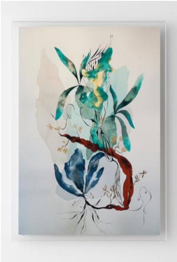
Endless Rhizome, 2025 Mixed, 76 x 56