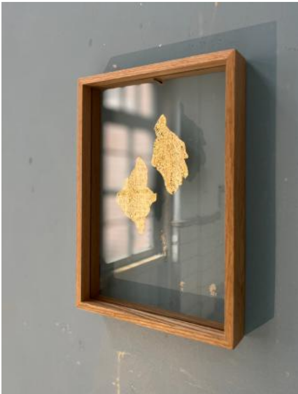
Becoming Form II, 2025