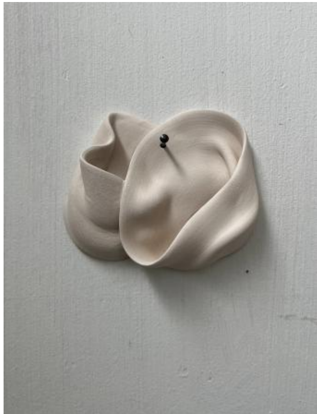
Merging Cups, 2024 Ceramics