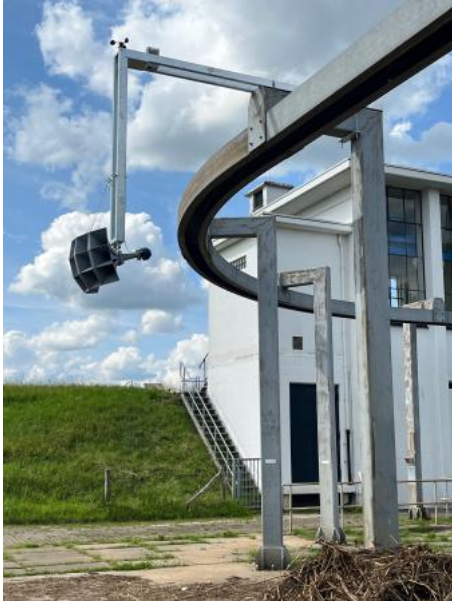
The Living Pump Station, 2025

2016 - 2025 founding treasurer Stichting WD4X 2013 - 2024 founding member and Chairman of iii