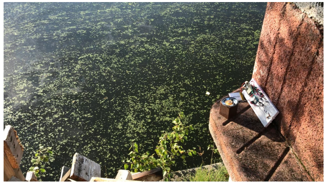
Komorebi Larva, 2020