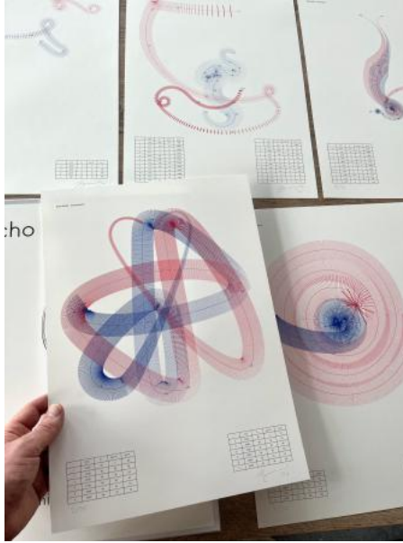
Echo Moiré graphic score, 2024