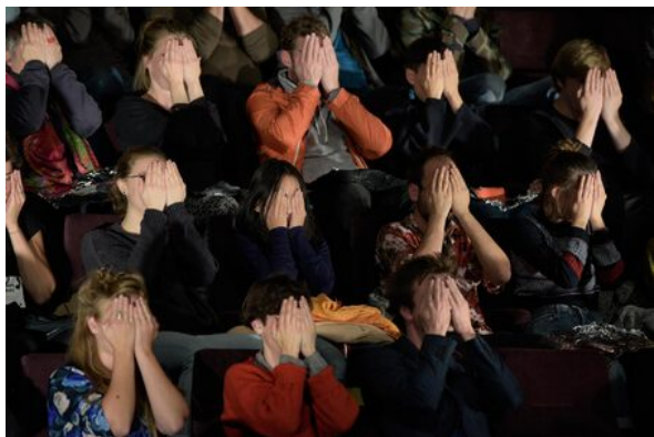
How to Defend Yourself from Danger, 2017