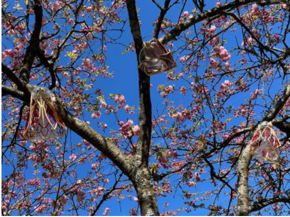
Chorusing Symbionts, 2026

2013 - founding member and Chairman of iii 2024