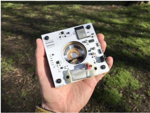
Komorebi Kit, 2021