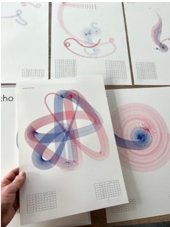
Echo Moiré graphic score, 2024