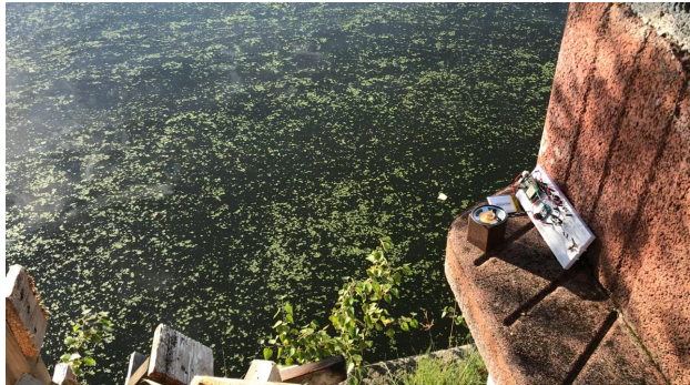
Komorebi Larva, 2020