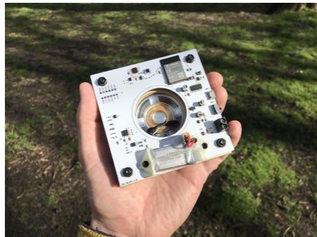
Komorebi Kit, 2021