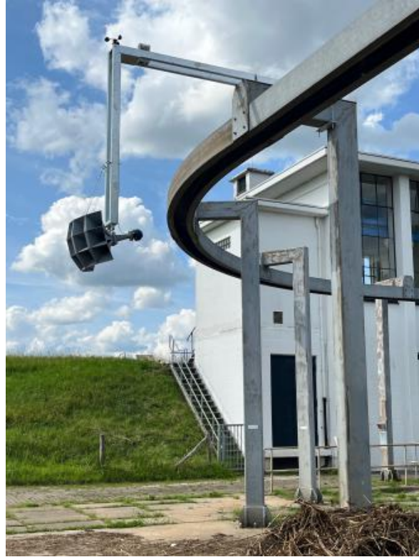
The Living Pump Station, 2025