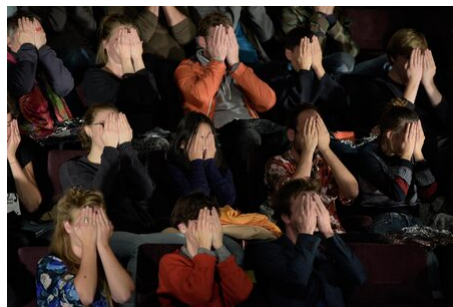
How to Defend Yourself from Danger, 2017