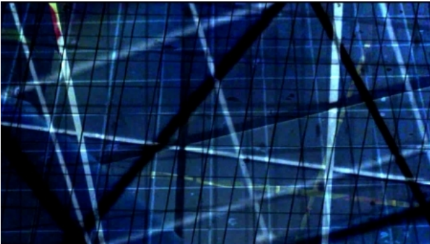
Grids, 2012 hd video