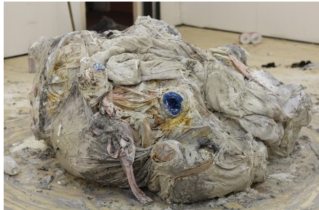
Gray, 2012 sculpture/performance