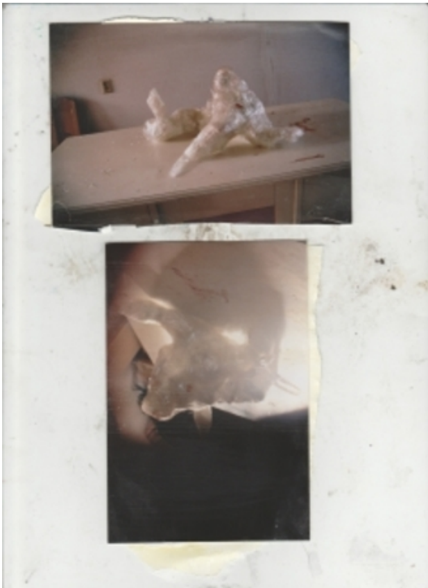
bailout, 2011 sculpture