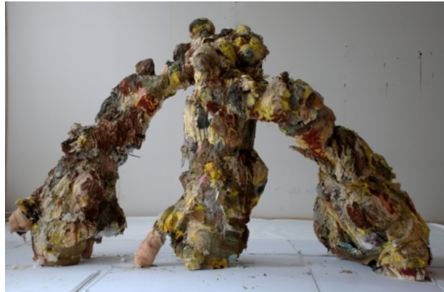
m, 2011 sculpture