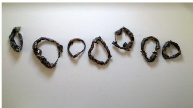
O's, 2013 sculpture