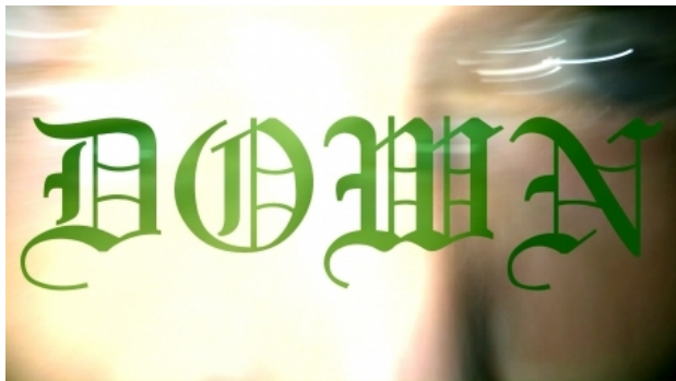
down, 2013 hd video