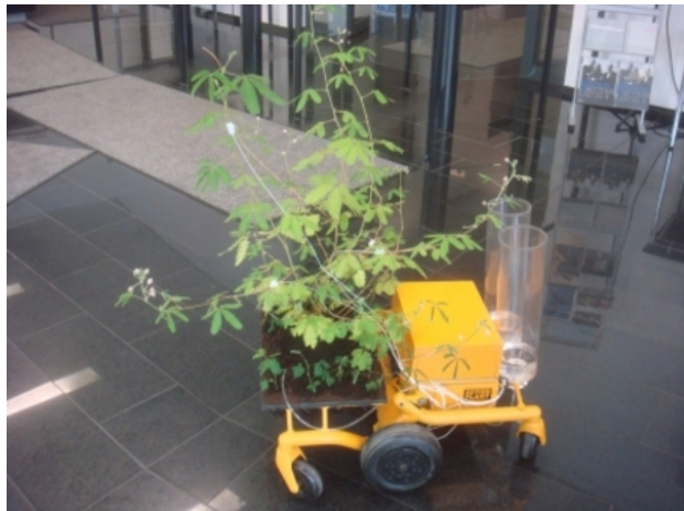
Jurema Action Plant, 2010 hybrid-machine+plant, 70x50x50