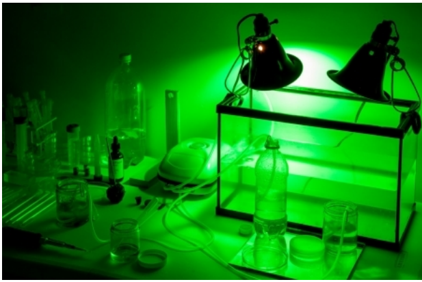
microscope Chamber #1, 2013 photo documentation of the installation