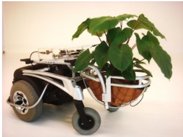
Prototype for a New BioMachine, 2012 hybrid-machine+plant