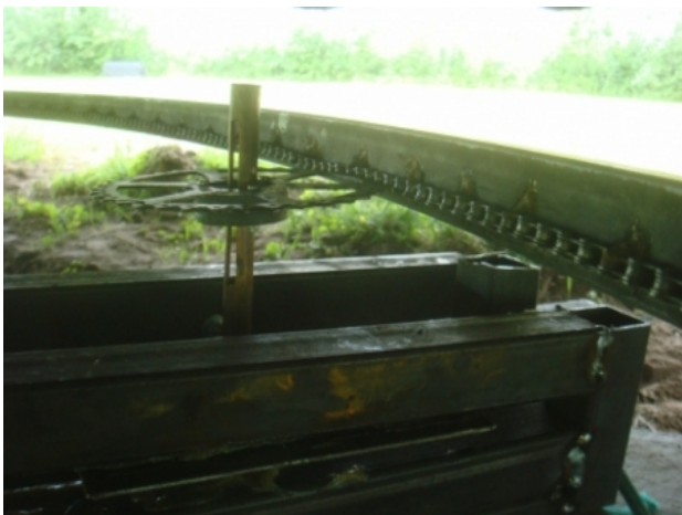
Solar Flares, 2012 photo documentation of the installation