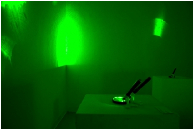
microscope Chamber #1, 2013 photo documentation of the installation