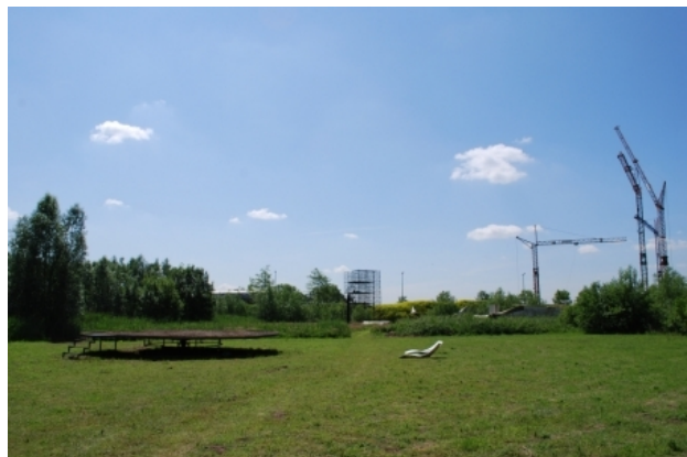
Solar Flares, 2012 photo documentation of the installation