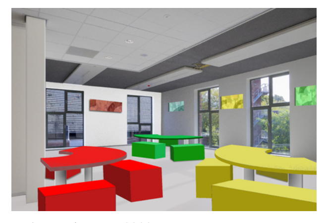
work on assignment, 2020