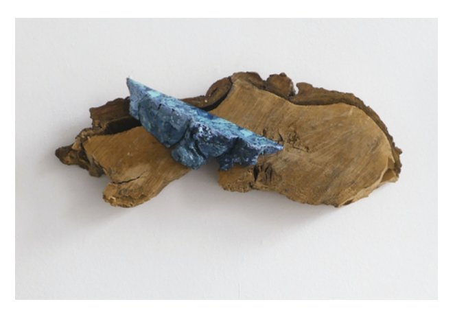
vulcanowood 1, 2018 mixed media, 60x30x18