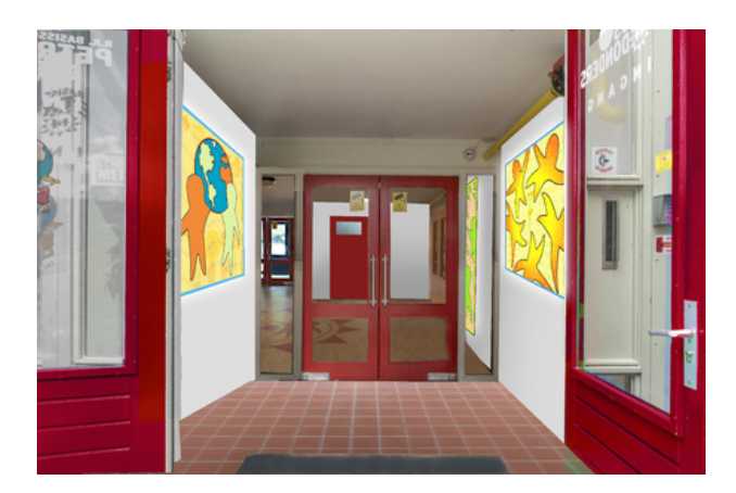
werk in opdracht, 2020