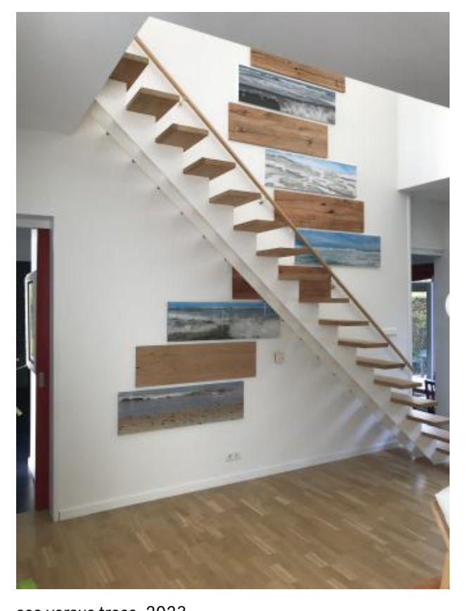
sea versus trees, 2023 mixed media, 98x224 inch