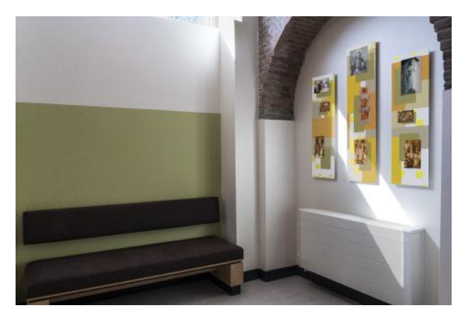
monumentale opdracht, 2021