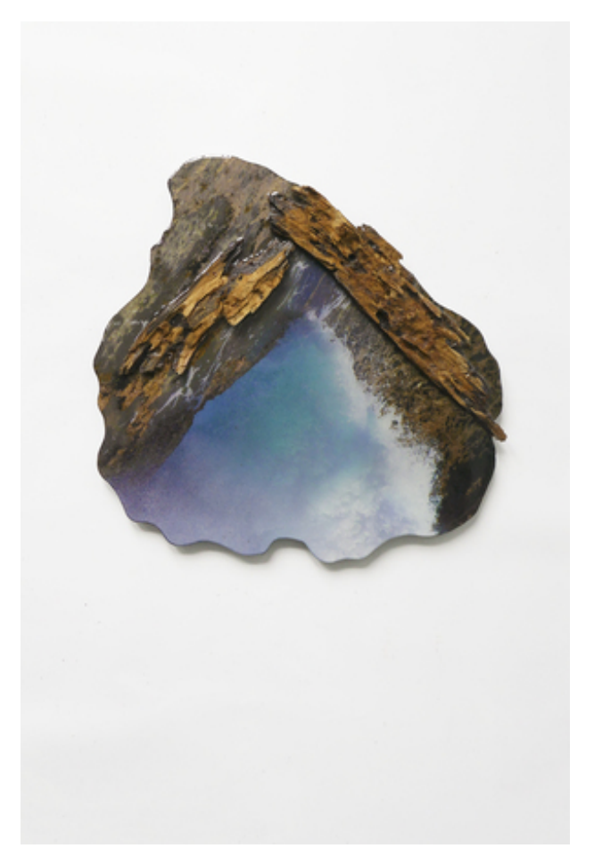
vulcanowood3, 2018 mixed