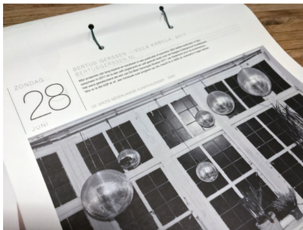
Photo in big Dutch Artcalendar, 2020 Analogue Photo, nvt