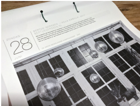
Photo in big Dutch Artcalendar, 2020 Analogue Photo, nvt