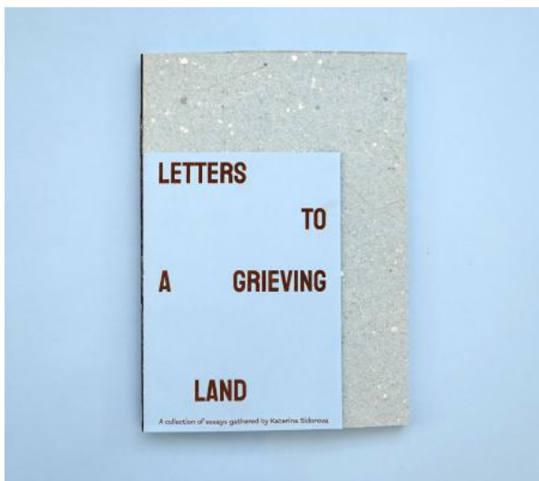
Letters to a grieving land, 2026 Book making, natural ink making, paper making, printing with natural inks, Riso print, 14x20 cm