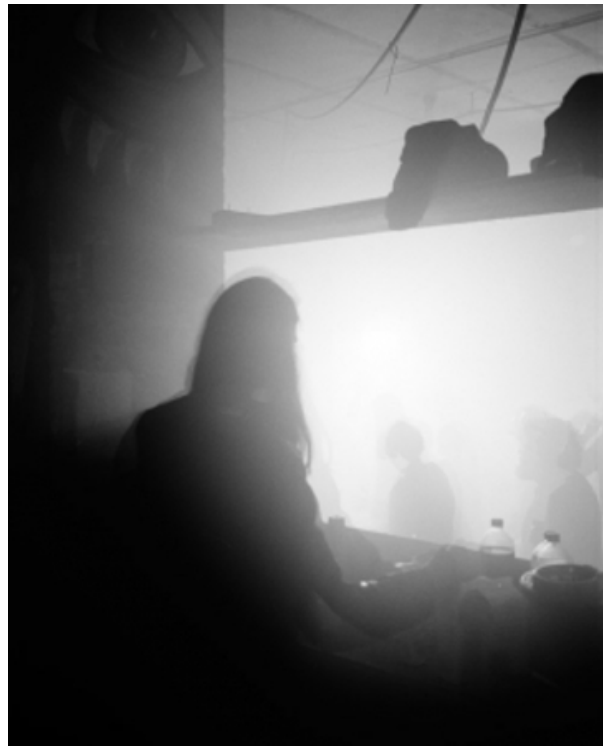
Dystopia, 2013 analogue photography