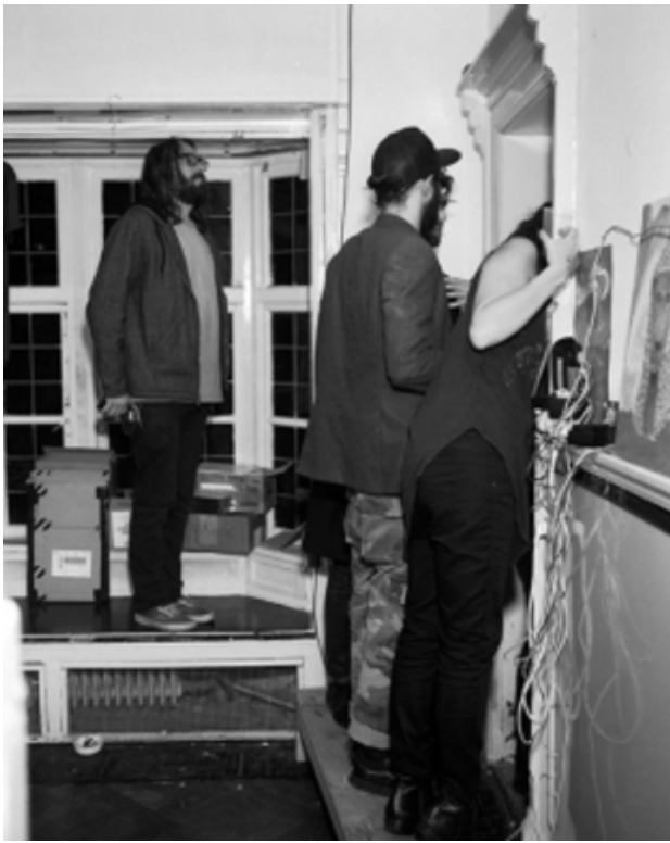
Villa Kabilla, 2013 analogue photography