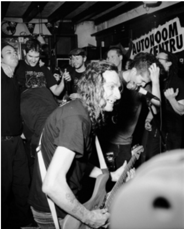
Autonom Centrum, 2014 analogue photography