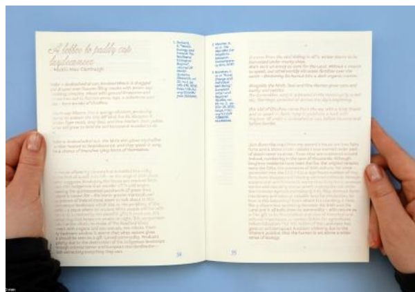
Letters to a grieving land, 2026 Book making, natural ink making, paper making, printing with natural inks, Riso print, 14x20 cm