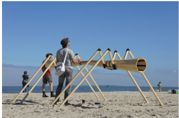
Sea Spider, 2012 wood, kite, 450 x 250 x 150