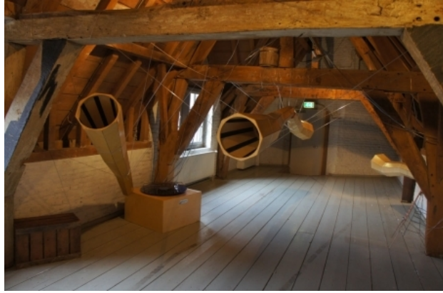
Gramo's Attic, 2014 mixed, 700 x 500