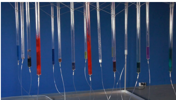
The Bubble Drum