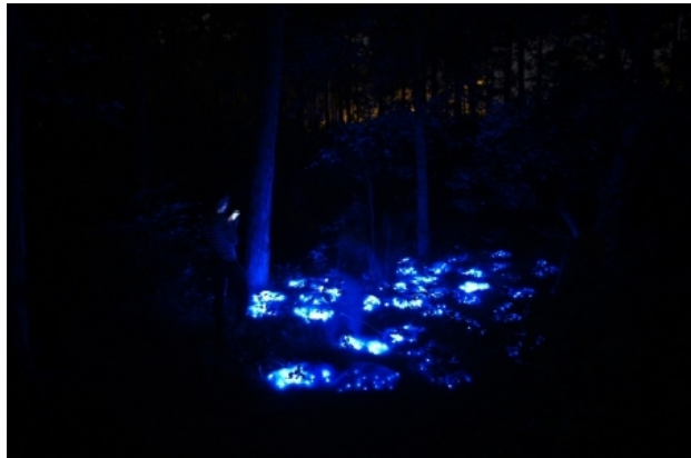
Forest Sparkle, 2014 mixed, 1000 x 700