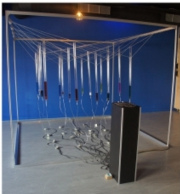
The Bubble Drum, 2017 Perspex, coloured water, pressurized air, 300 x 300 x 270

2007 - gastleraar interfaculteit Beeld en Geluid / 2007 ArtScience