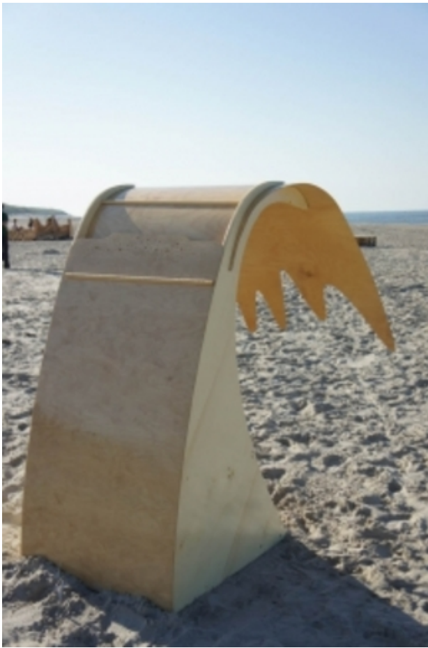
Tune Into Wave, 2012 wood, kite, 170 x 100 x 100