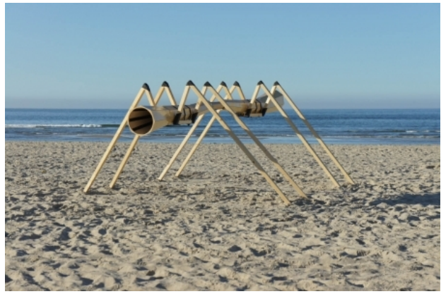
Sea Spider, 2012 wood, kite, 450 x 250 x 150