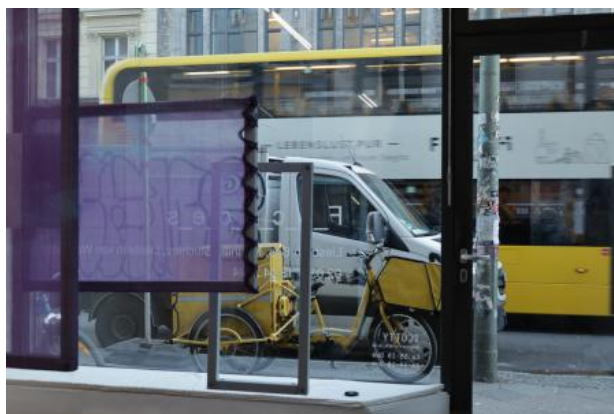
F.A.C.A.D.E.S., 2024 Installation , 150x150x100cm