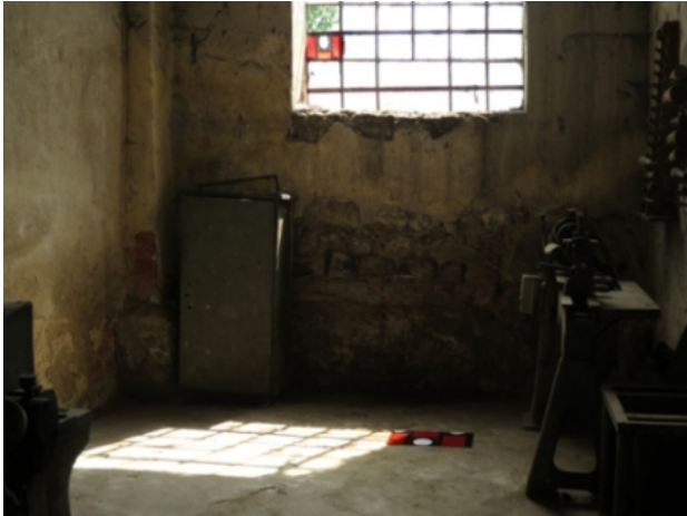
healing injuries, 2014 installation