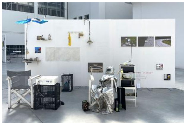
remember displace, 2024 installation, nvt