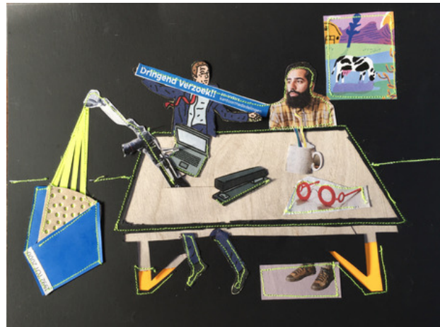
Light on the matter, 2020 mixed media on paper, A3