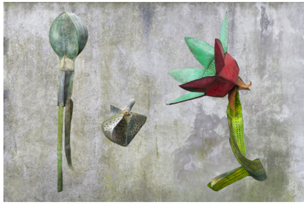
FLOWERS, 2019 mixed media froms recycling textile paper and wax, diverse formaten tot 1 m L