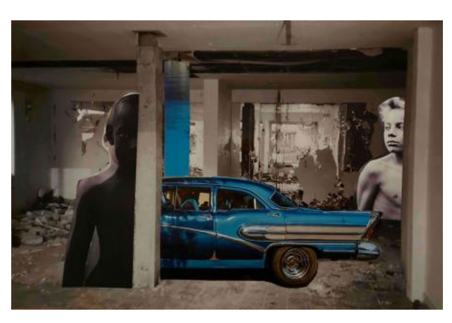
geen titel, 2023 mixed media, A4