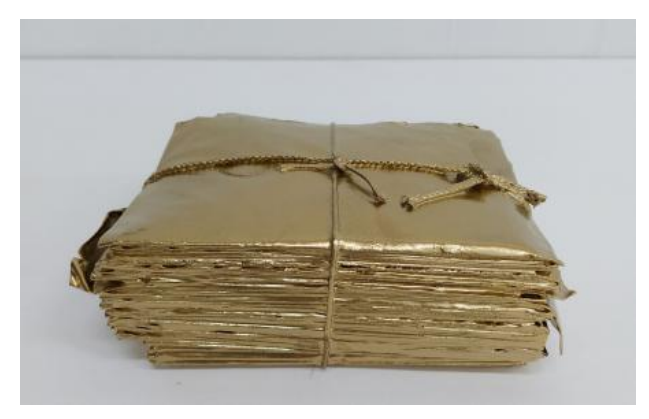
love letters, golden memories, 2022 mixed media, 50x20