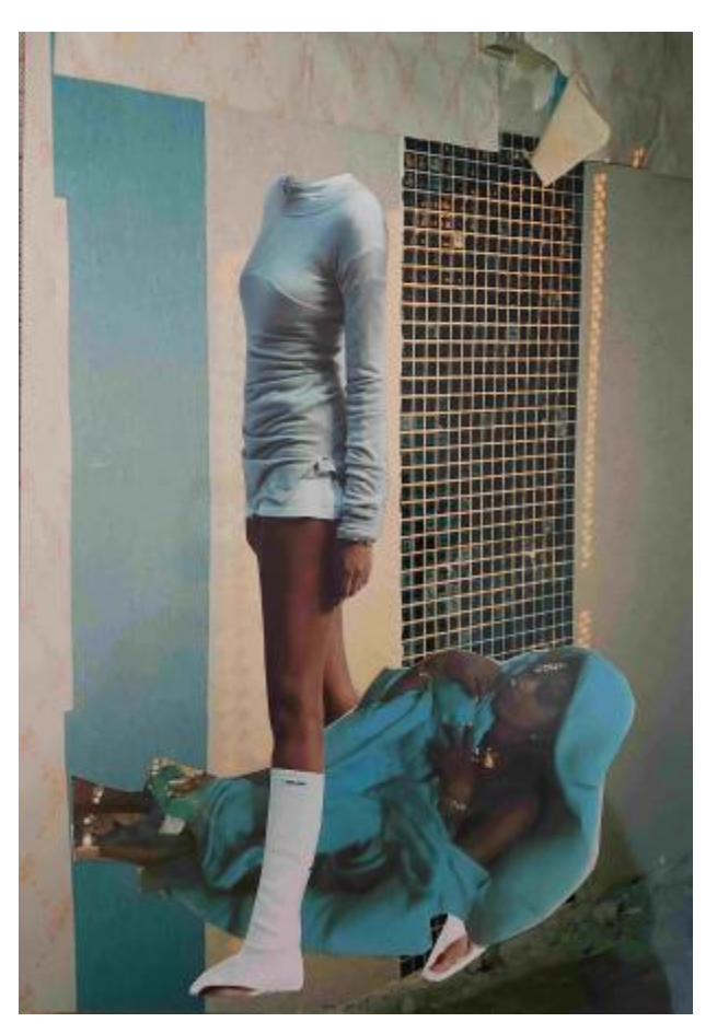
geen titel, 2023 mixed media, A4