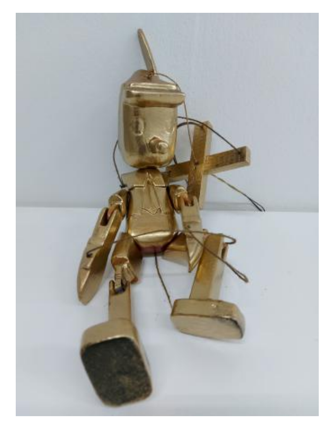
pinoccio, colden memories, 2022 geen, 40x30 cm