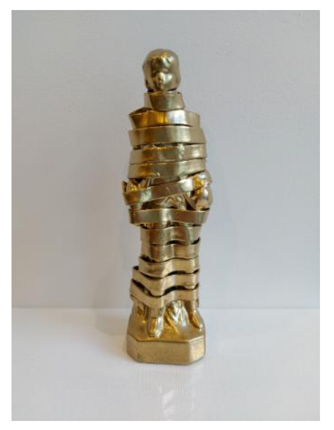
nummer 1, 2024 mixed media, hoogte 19 centimeter