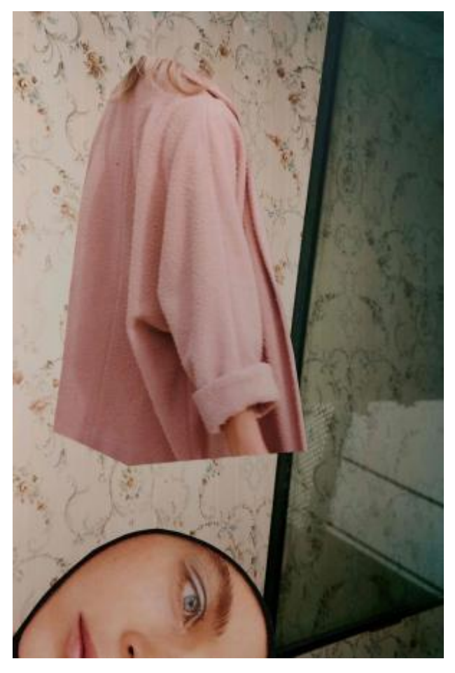
geen, 2023 mixed media, A4