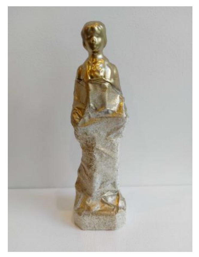
nummer 2, 2024 mixed media, hoogte 19 centimeter