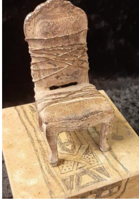
Magic carpet, 2022 Bronze, Stone, 15 cm H