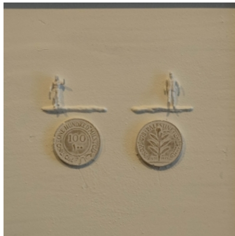
White roses & Jesus was a Jew, 2018 Mixed media, 40x40