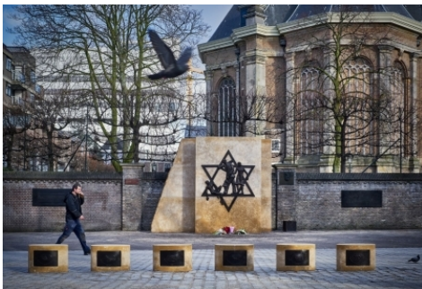
Lest They Be Forgotten, 2018 Bronze , Limestone, Light installation, Located on the whole square