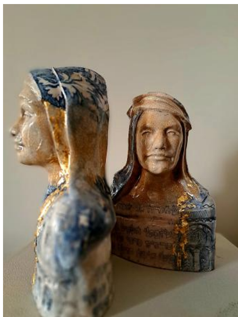
The making of the monument, 2024 6 min