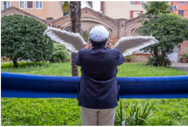
'Celestial Salutations', 2024 Costume Performance