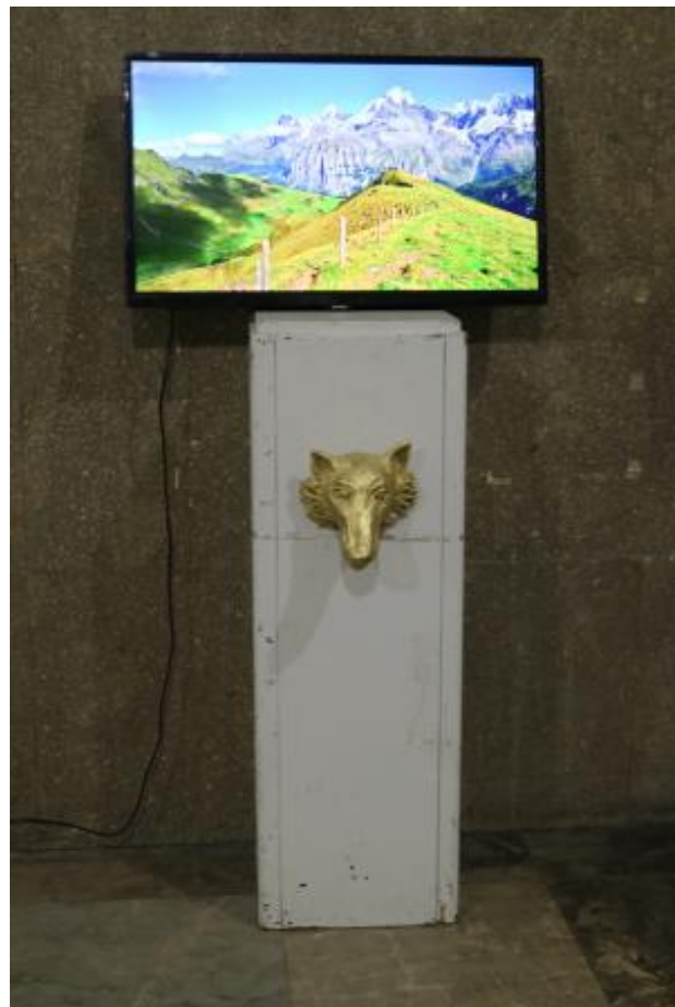
'Let us howl, in praise of Vučko', 2025 video, 150 x 80 x 80 cm