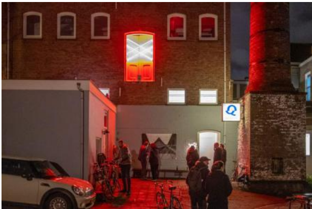
St. Andreas waakt over ons, 2024 Licht en geluidsinstallatie, Gevel Quartair gebouw