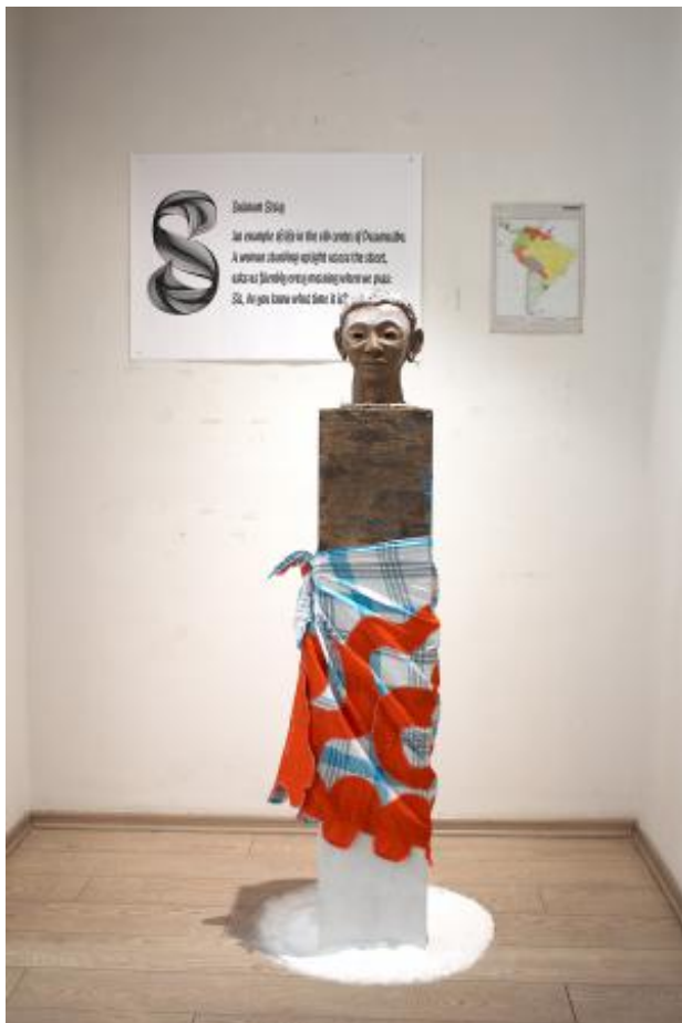
'Women of Loth', 2025 Installation, 300 x 200 x 200 cm