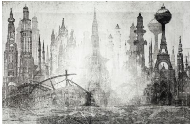
Apocalyps, 2023 etching, 80 x 120 cm.