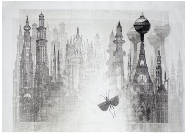
Hope, 2024 etching, 80 x 120