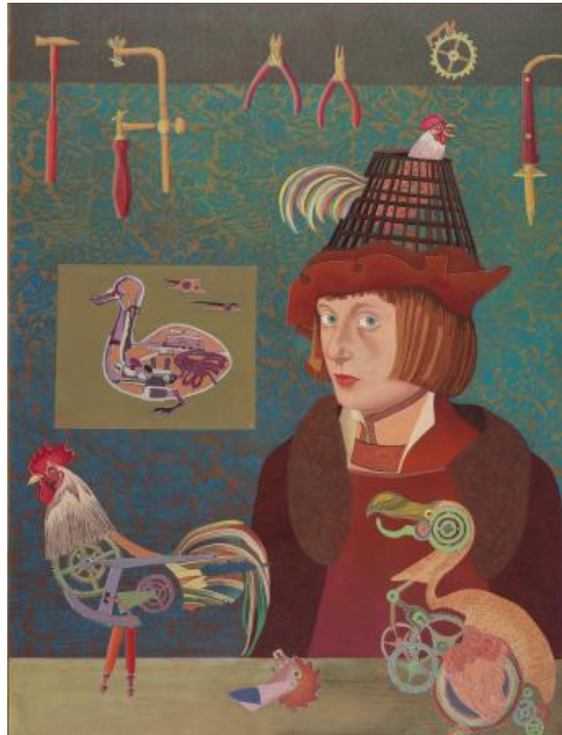
The birdcatcher, 2022 acrylic paint, 80 x 100