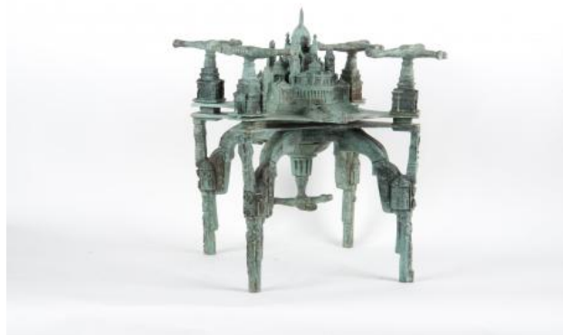
Drone city, 2024 bronze, 36 x 30 x 37