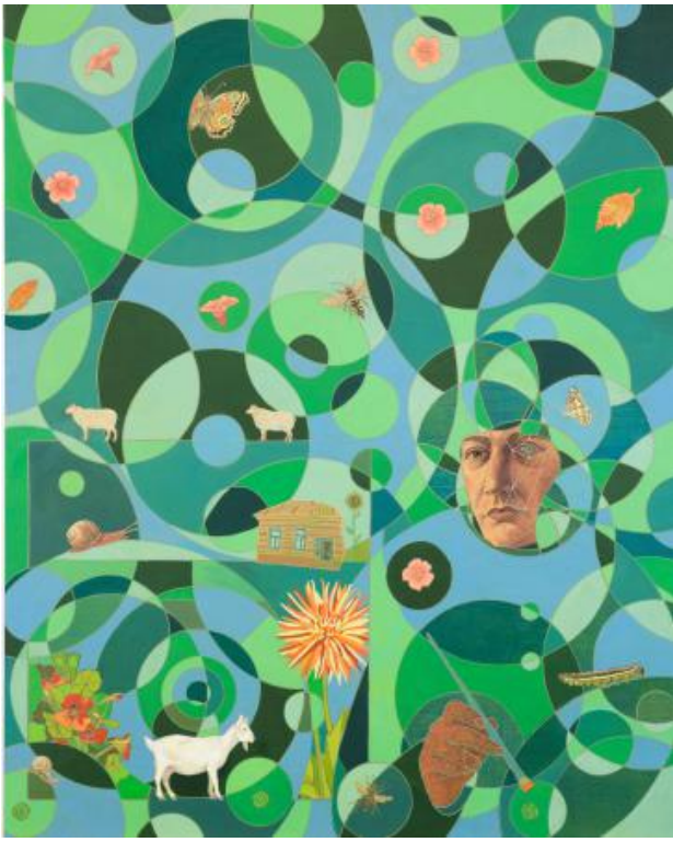
Remembering my garden, 2024 acrylic paint, 80 x 100