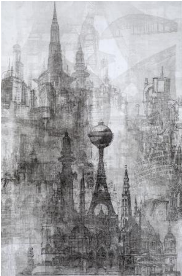
Babel, 2023 etching, 120 x 80