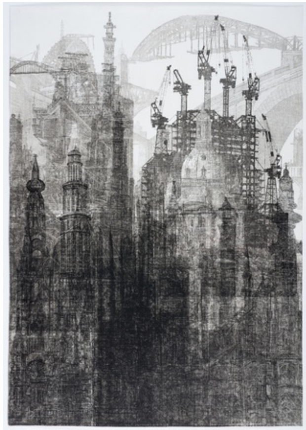
The city where people could not stop building, 2022 etching/monoprint, 70 x 100