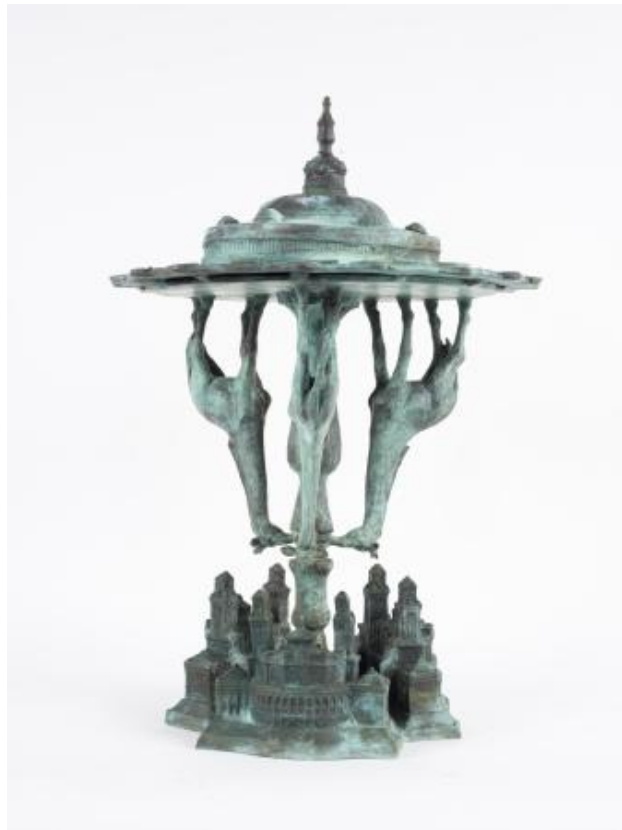
Circus in town, 2023 bronze, 27 x 27 x 40