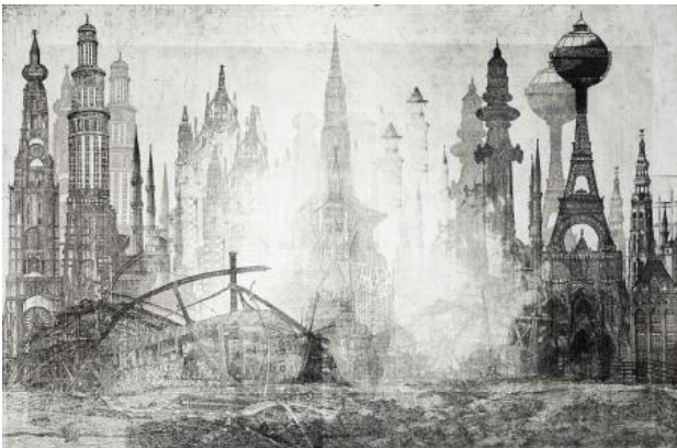
Apocalyps, 2023 etching, 80 x 120 cm.