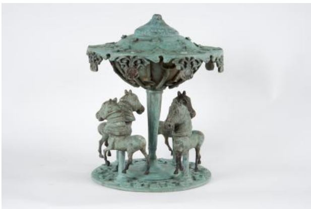
Carousel, 2019 bronze, 26 x 26 x 33