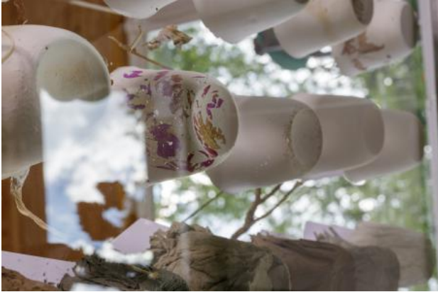
Plantscapes; It's a love story, Earthly Provenance | Ancestral Intimacy, 2022