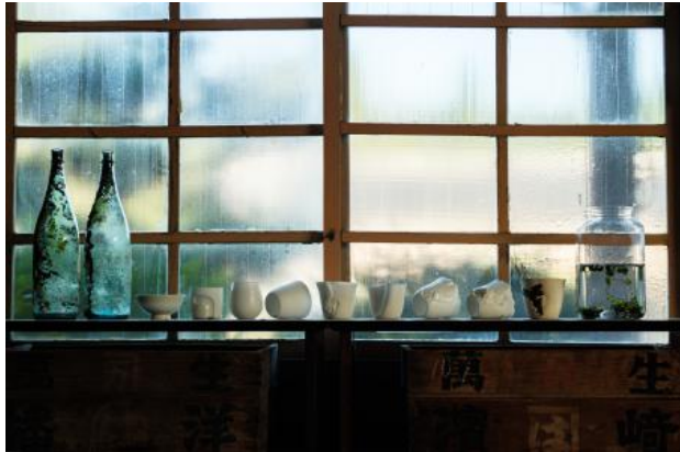
Seeking the light of the Shadow, Arita, Japan, 2024

2015 - -- AWN, member of Volunteers in Archeology On-going