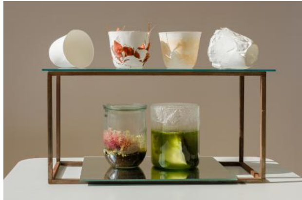
Still-Life, botanical eggshell porcelain, 2024