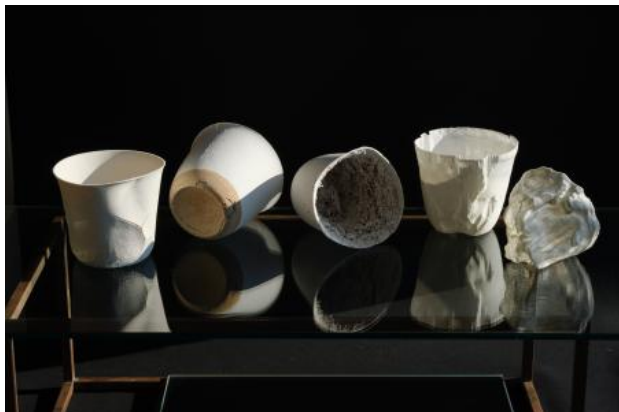
Still-life | Collection of Cups with Soul 2020-2023, 2023