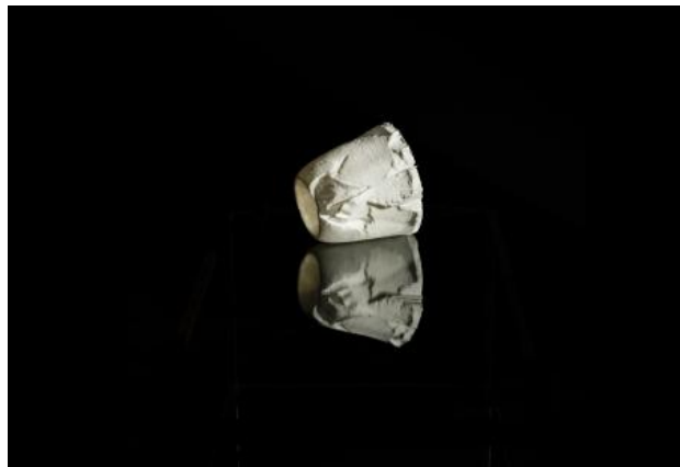
Biodigital Eggshell Porcelain, 2023