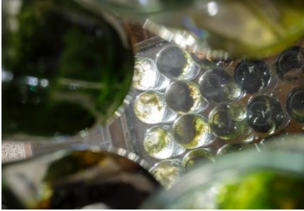
It's a love story, 2022