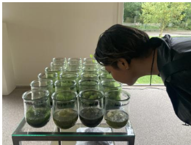
It's a love story, Earthly Provenance | Ancestral Intimacy, 2022