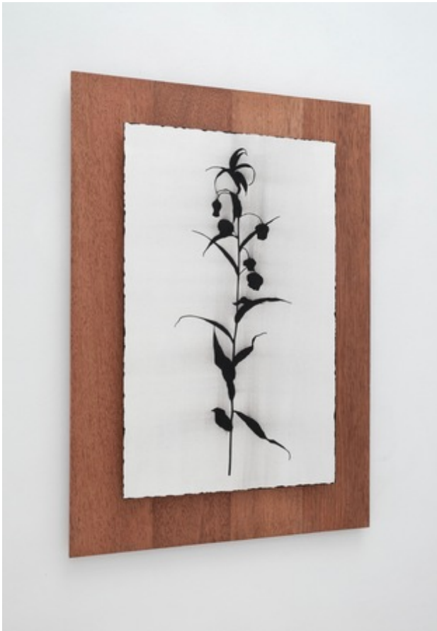
Untitled, 2019 acrylic and alkyd on paper/aluminium op merbau panel, 52 x 36 cm

25 years anniversary Galerie Ramakers, 2019 acrylic and glass bowls on wall, 310 x 1150 cm