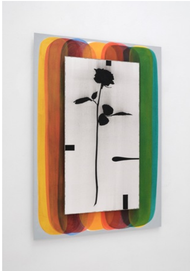
Untitled, 2019 acrylic on paper/aluminium, 52 x 36 cm