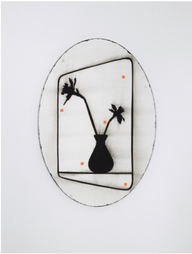
Untitled, 2018 acrylic and alkyd on paper/aluminium, 44.5 x 31 cm