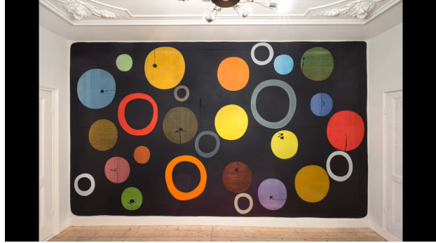
Guess things happen that way , 2017 00:35