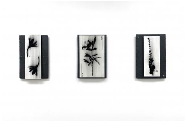
Untitled, 2022 Acrylic on paper/aluminium and roof slate, 30 x 25 cm