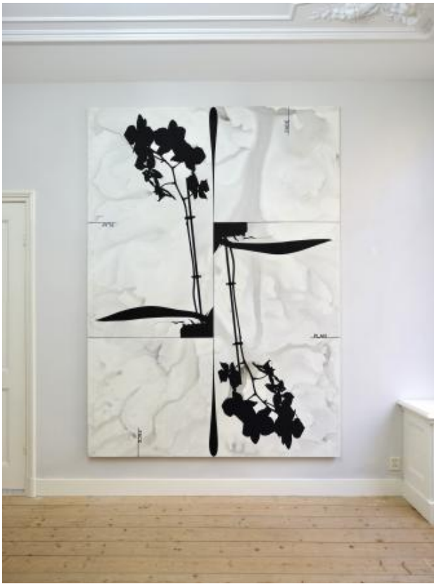
Untitled, 2022 Acrylic on canvas, 250 x 180 cm