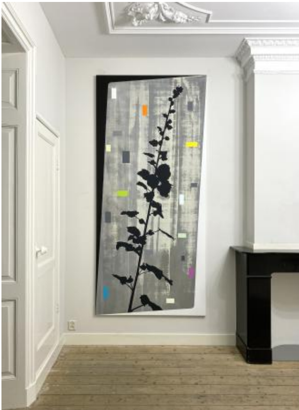
Untitled, 2022 Acrylic on canvas, 250 x 115 cm