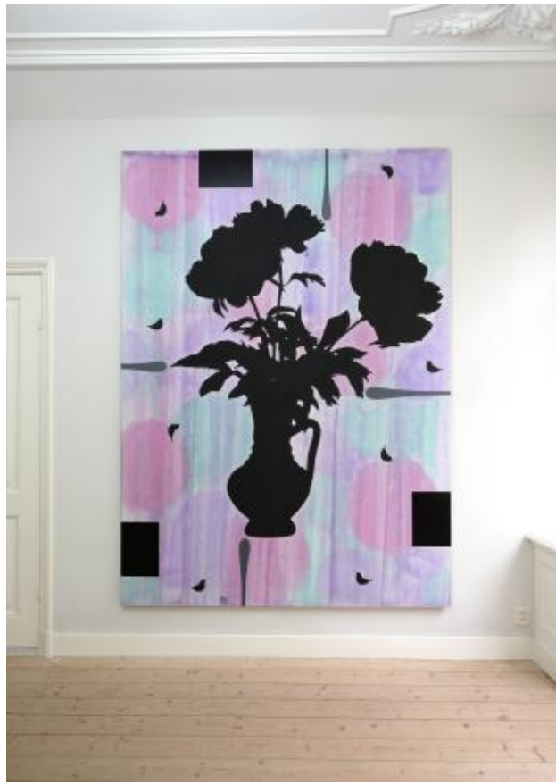
Untitled, 2022 Acrylic on canvas, 250 x 180 cm