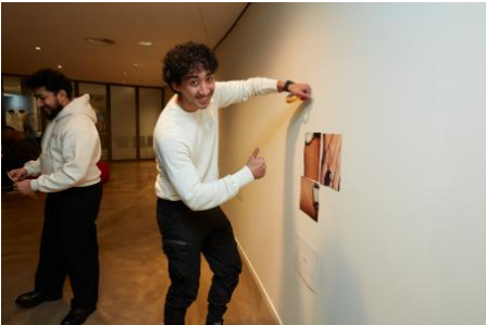
Algorithmic Thinking with Photography, 2024