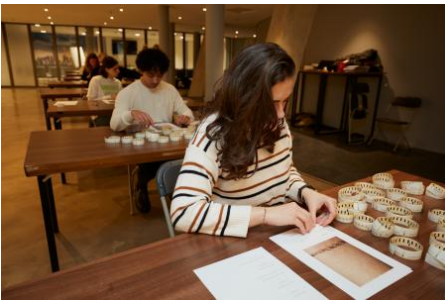
Algorithmic Thinking with Photography, 2024