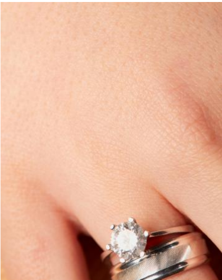
COLOUR, 2024 digital photography, material variable, variable