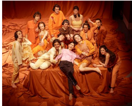
I never wanna dance again, 2024 performance, https://vimeo.com/1082821205