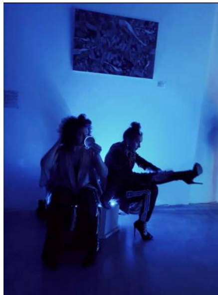
Serendipity, 2023 performance