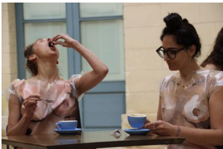
My Body (is)/(not) Your Business Card, 2023 performance, https://vimeo.com/833612647?share=copy