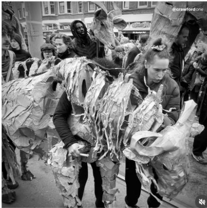
the Herds, 2026 performance /puppets, -