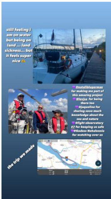
Light Observatory#&, 2023