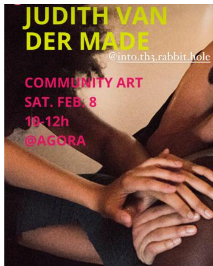
what if we redefine words by experiencing them with our bodies , 2025 community art, https://vimeo.com/1055615662?share=copy