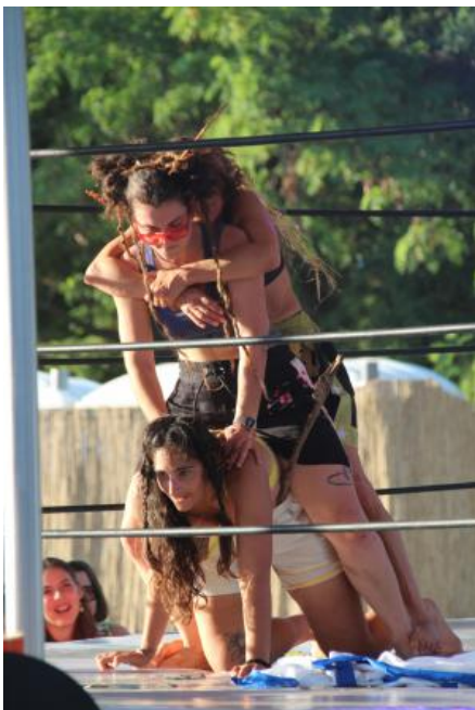
in & out of ecstasy, 2025 performance