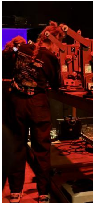
Leaking Lights #2, 2026 16mm film, -