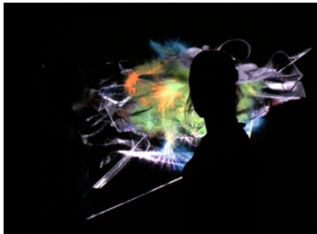
Painting Apparatus 1.1, 2011 video painting (single screen), 400x300