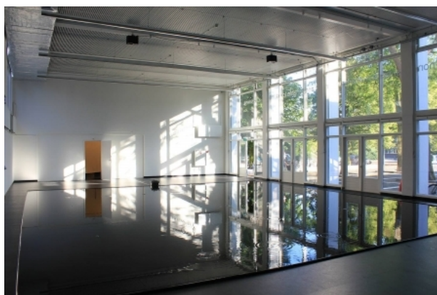
Clepsichor II, 2013 active installation with water, n/a