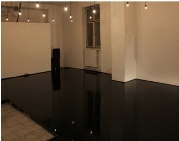
Clepscichor I, 2012 active installation with sound and water, n/a