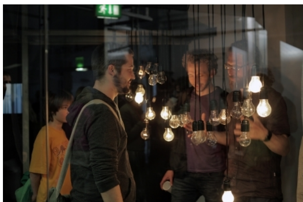
Electricle, 2014 interactive installation, n/a