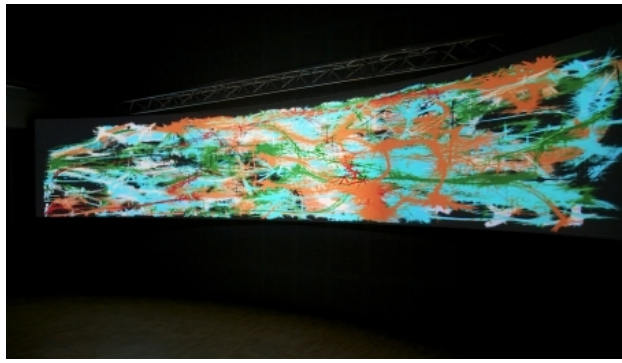
Painting Apparatus 1.0, 2011 video painting, 1400x140