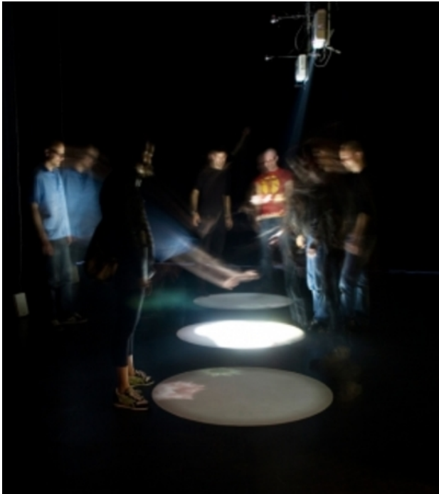
Concert of Angels, 2008 video installation