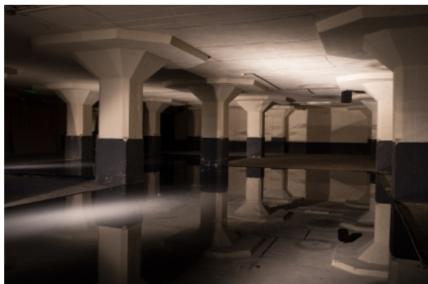
Clepsichor II, 2016 active installation with water , 2000x1400

2007 --- Video and audio software developer