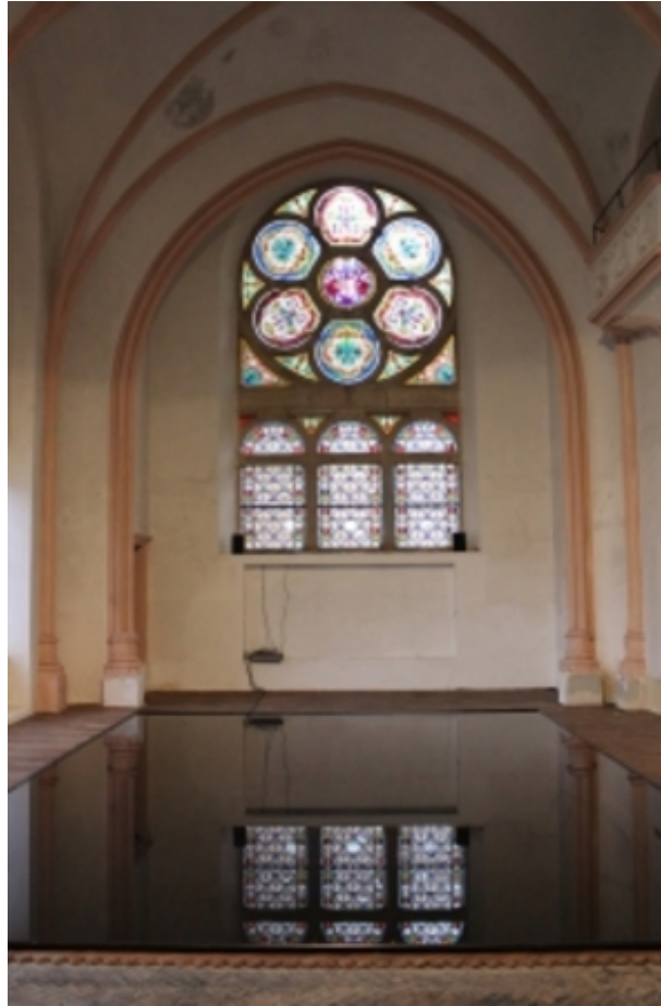
Clepscichor II, 2012 active installation with sound and water, n/a