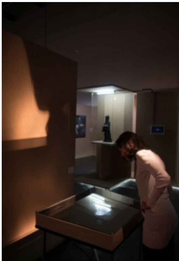
Narcissus, 2014 interactive sculpture, 70x80x110