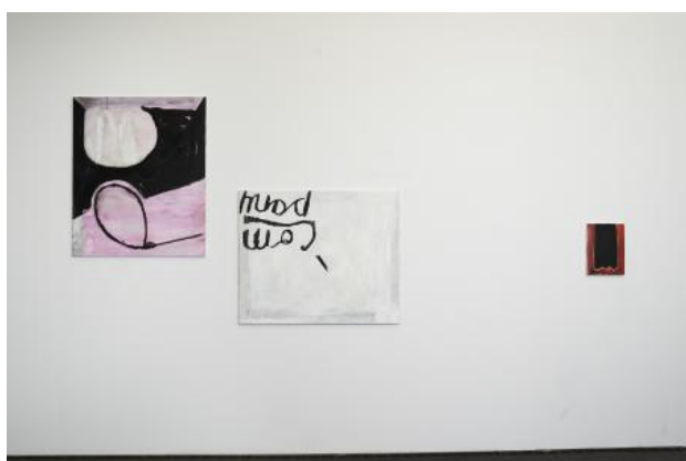
Parallel Vienna, 2019