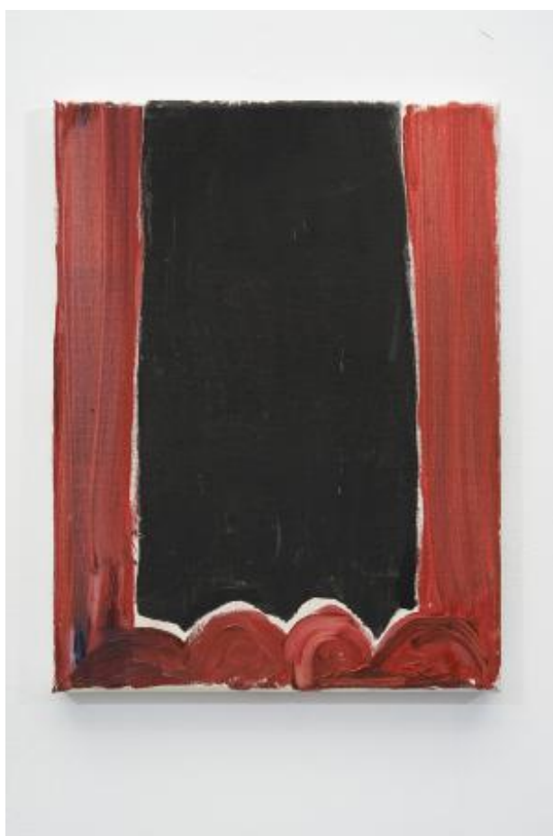
Of Modern Poetry, 2018 oil on linnen, 30x40