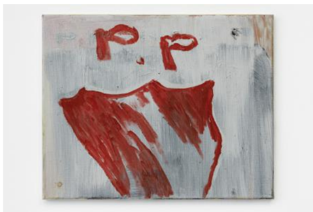
P.P. Boots, 2020 oil on linnen, 30x40cm