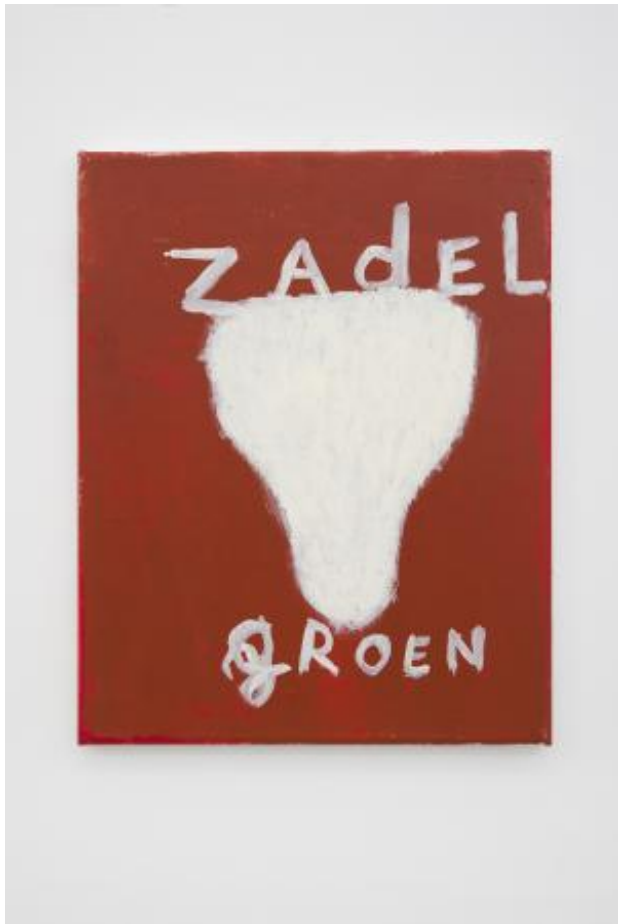
Zadel (Groen), 2025 oil on linnen, 30x40