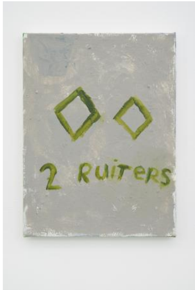
Frogs Eat Butterflies, Snakes Eat Frogs, Hogs Eat Snakes, Men Eat Hogs, 2024 oil on linnen, 40x30