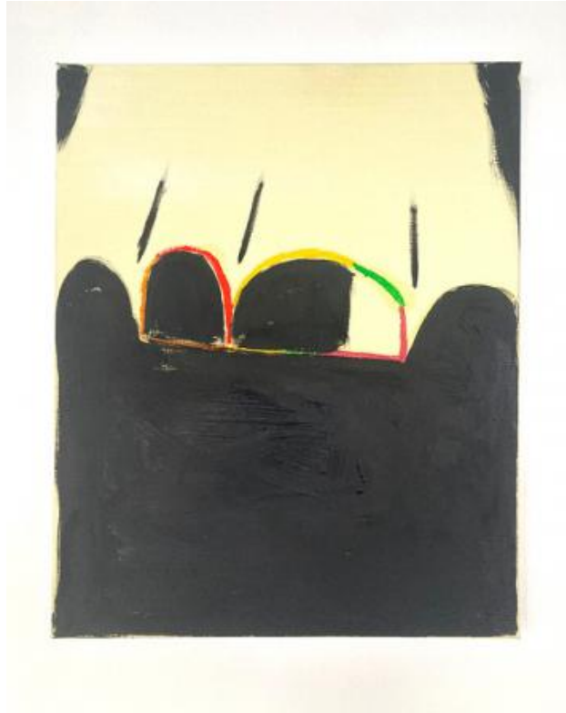
How to Find Relationships That Are Good for You and Avoid Those That Aren't. , 2023 Oil in linnen, 40x50 cm