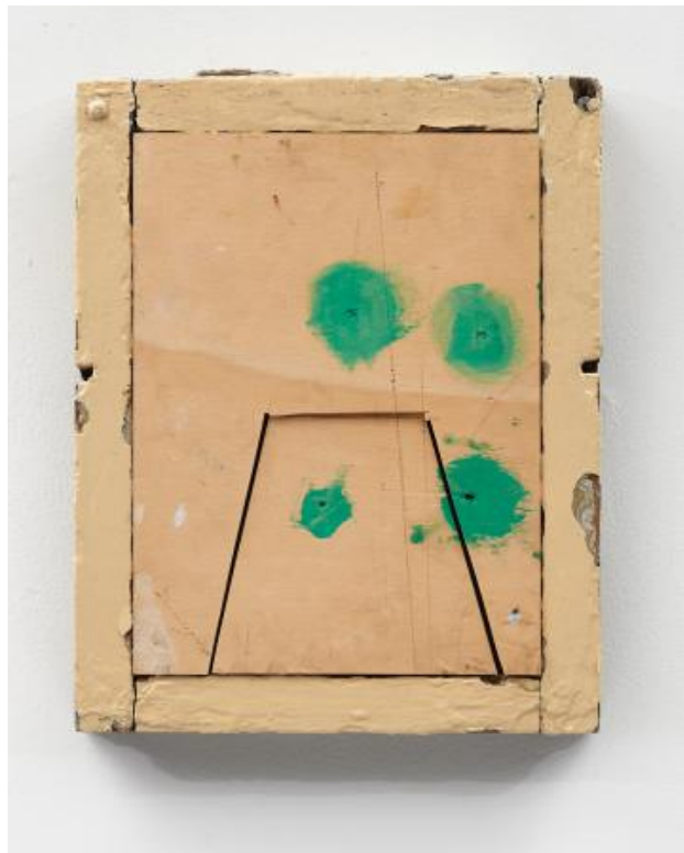
Reality is not what is used to be, 2022 Oil on wood, 32x40cm