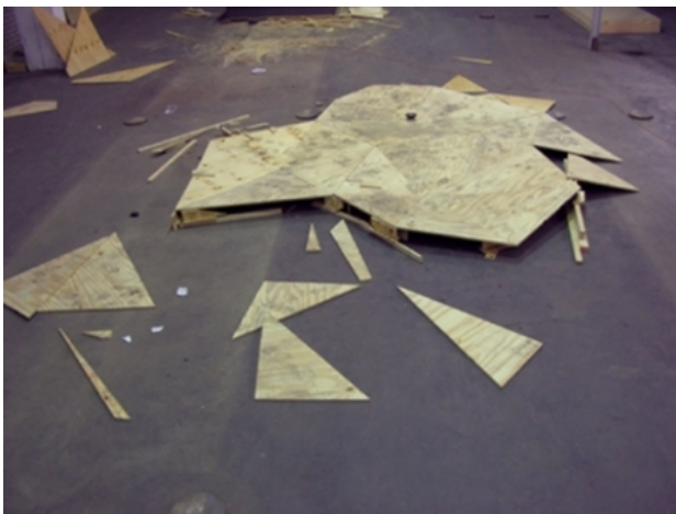
Vloerwerk in opbouw Billytown, 2007 hout, 30m2