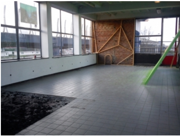
expo Station Noord R'dam, 2011 hout/houtskool/verf, n.v.t.