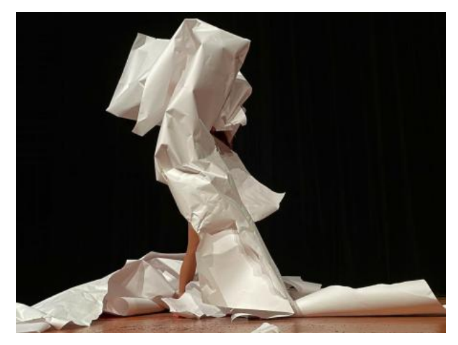
PAPER STUDY #26_ STAGE PRESENCE, 2020 Live Art, 25 minutes