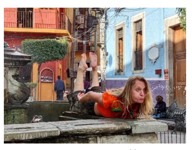
Paper Study#24_ mixed up archetypes (F)., 2022 performance art, 25 minutes