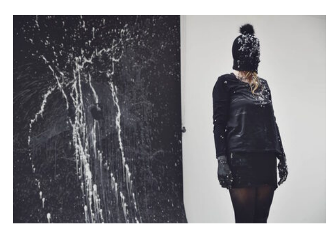
Paper Study #21_ Invisible Visible, 2019 performance, 3x3x3 m duration 1,5 hour