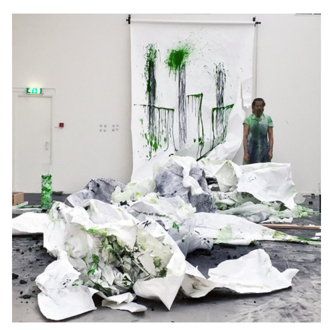
Paper Study #20_ Breathing Landscape, 2019 performance installation, 5x3x3 m