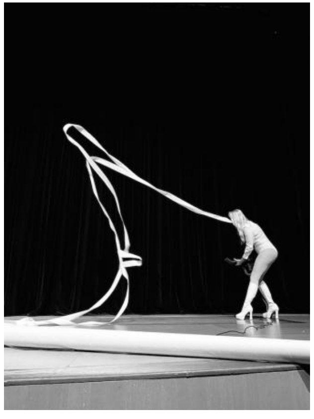
PAPER STUDY #26_ STAGE PRESENCE, 2020 Live Art, 25 minutes