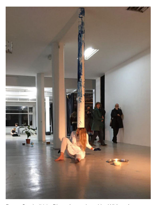
Paper Study #11_ Blueprint replaced by Whiteprint, 2018 performance, rol papier is 2,75