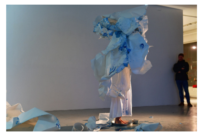
Paper Study #11_ Blueprint replaced by Whiteprint, 2018 performance, rol papier is 2,75