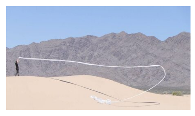
Study in Blue_#2_Integrity, 2019 landscape performance, 100 meter duration 1 hour