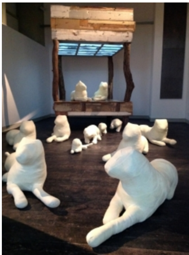
Allegory Splinter Revisited, 2016 Mixed Media, 3,2 x 6 m