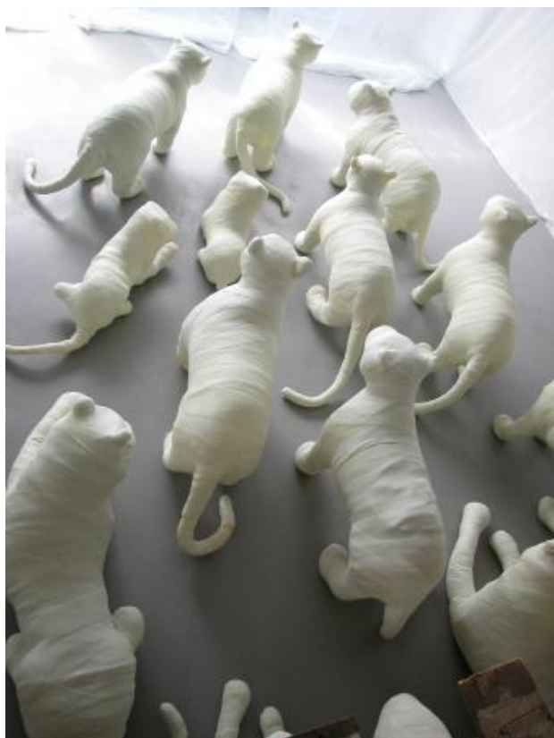
Heaven Revisited, 2016 Video Installation, 1,8 x 2,8 m