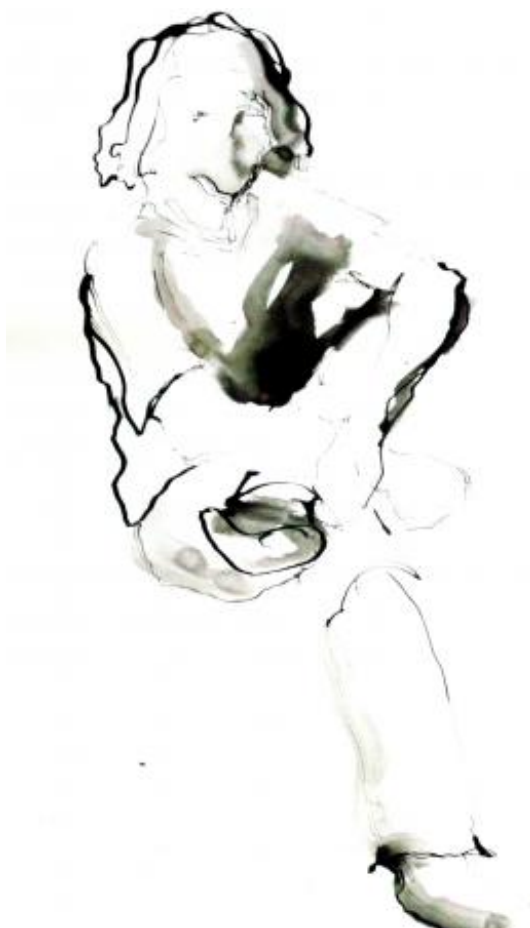
Not about You, 2016 Ink, 0,6 x 0,8 m