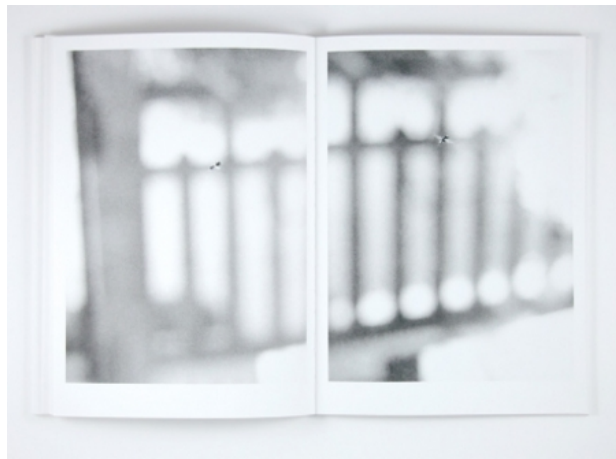
Jochen Lempert, Recent Field Works, 2009 Offset, 20×27.5 cm