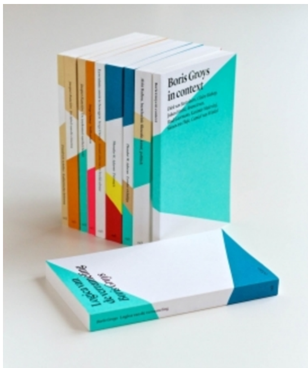
Octavo publicaties, 2013 mixed techniques, 11.7×18.5cm

2010 - Teacher in Master of Art Direction, 2014 ECAL/University of Art and Design, Lausanne, Switzerland