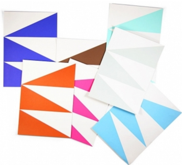
Flyers for Walden Affairs, 2009 Offset, Laser, 14.8×21cm