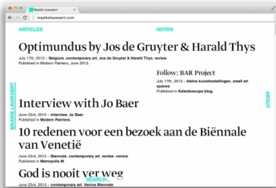
Maaïke Lauwaert, 2011 HTML, CSS, PHP, Javascript, variable