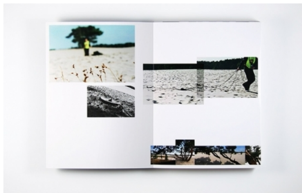
Justin Bennett, The City Amplified, 2009 Offset, 17×23 cm