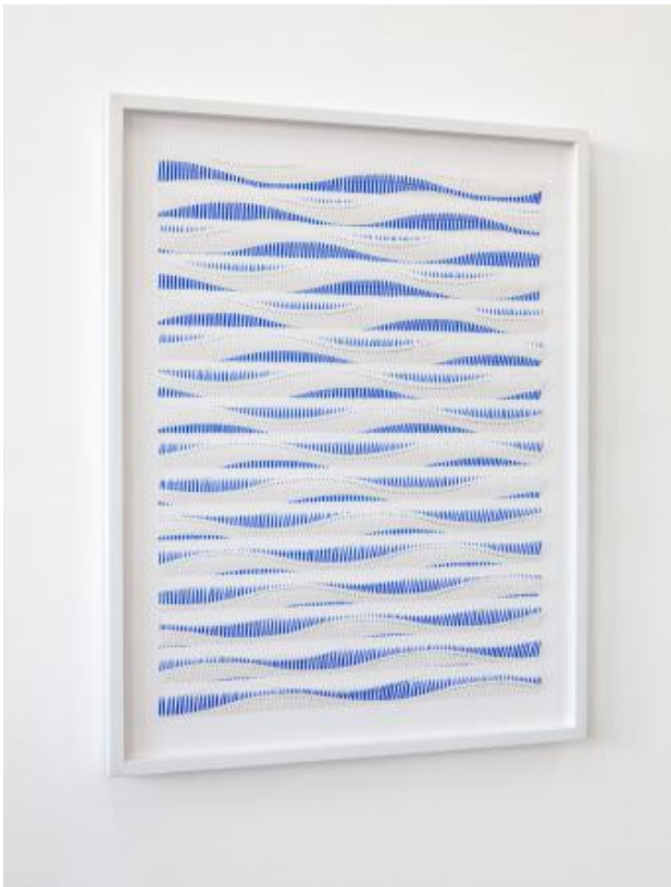
Waves (blue), 2022