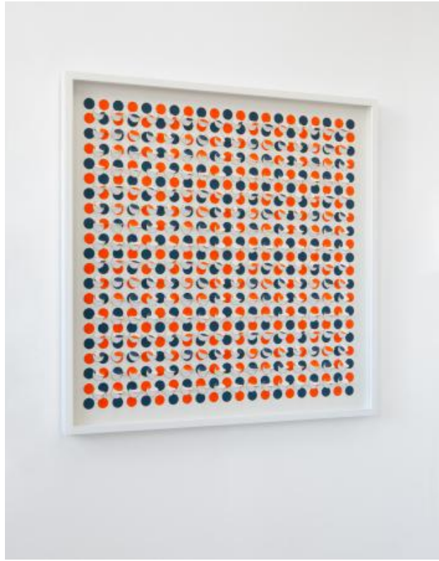
Burnings (Colored Variation #1), 2022