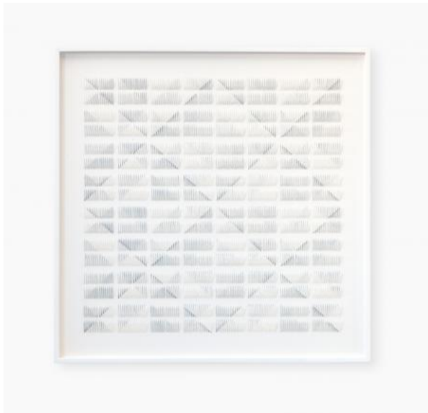
weaving V, 2025 relief, 70 x 70 cm