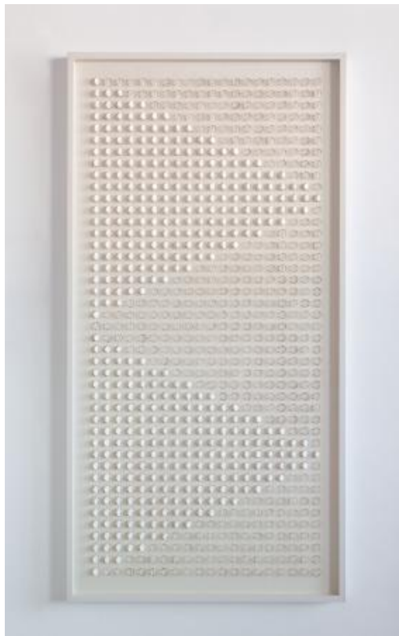
Burnings (variation #9), 2021