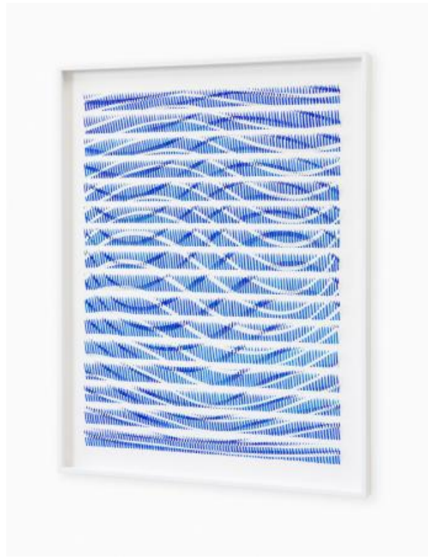
Line Series IV (Mirrored), 2024 watercolor on paper manually cut, 65 x 50 cm