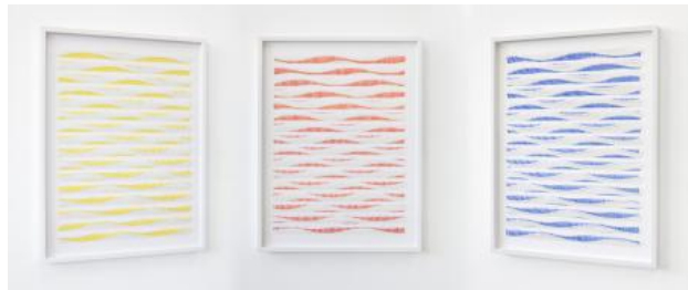
Waves (Red, Yellow & Blue), 2022