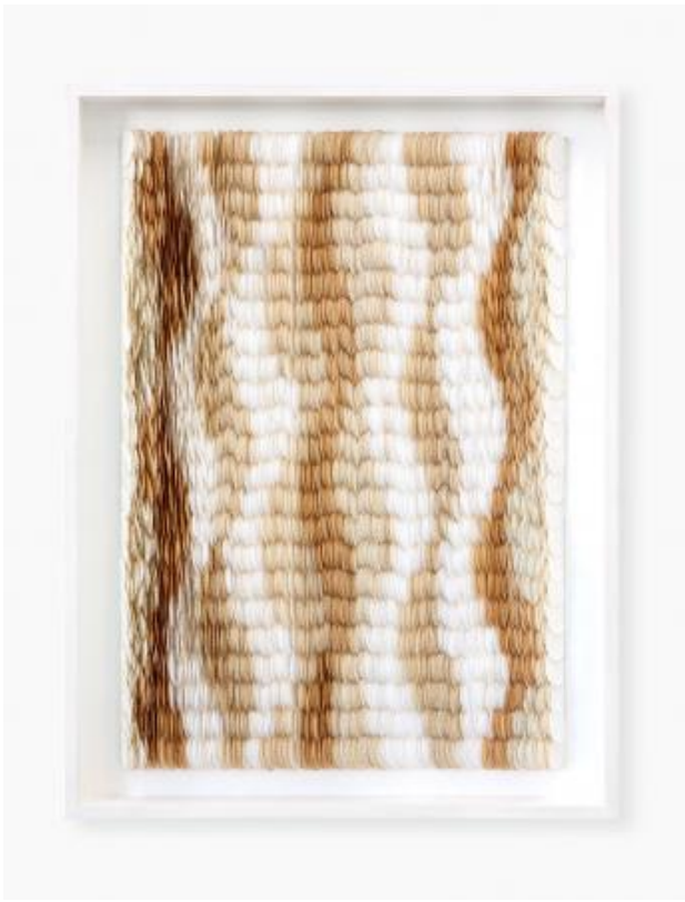
Resonance, 2024 manually burnt paper circles, glued on dibond, 64 x 48 cm