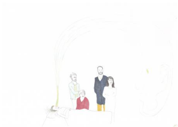
Family series 33, 2020 Drawing, 70x50cm

2017 - Initiator and board member: 2019 www.thehaguecontemporary.nl 2017 - -- Head of the board: www.page-not-found.nl On-going 2011 - -- Initiator and board member: www.alternativeartguide.nl On-going 2008 - Cultural Ambassador for Den Haag 2008 2006 - -- Docent at the Royal Academy of The Hague On-going 2004 - -- Curator/ Co-Director at 1646, www.1646.nl On-going