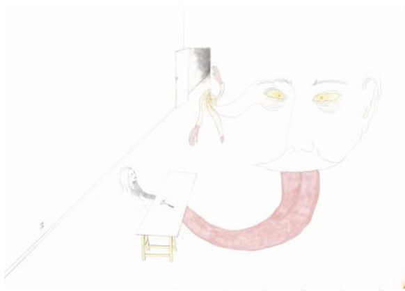
Family series 30, 2020 Drawing, 70x50cm