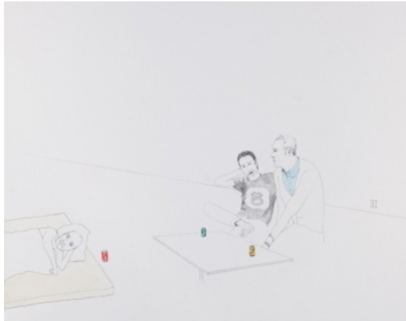
Family series 28, 2011 Drawing, 40x50