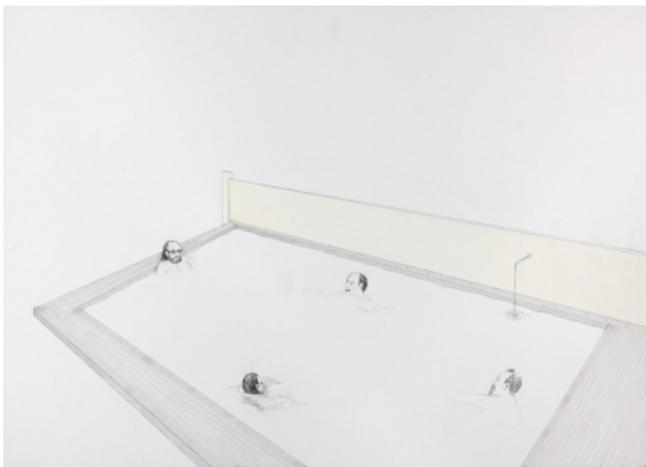
Family series 17, 2011 Drawing, 50x70