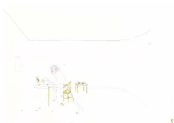
Family series 31, 2020 Drawing, 70x50cm