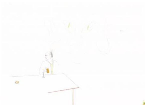
Family series 32, 2020 Drawing, 70x50cm