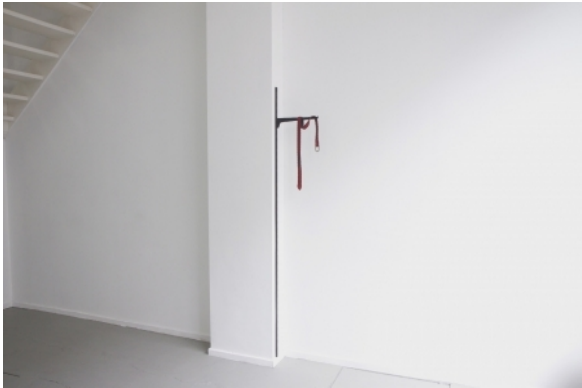
Red aura, 2016 Sculpture