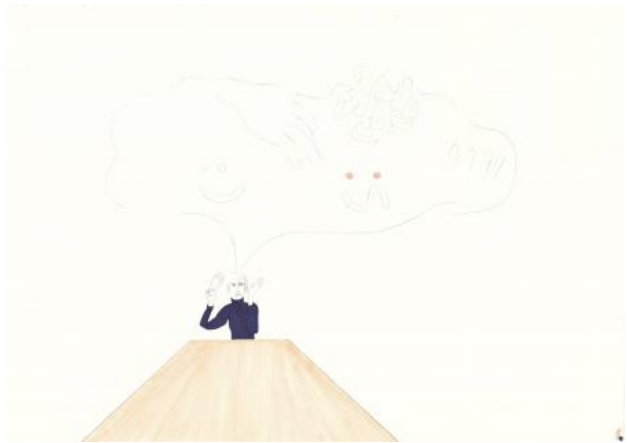
Family series 29, 2020 Drawing, 70x50cm