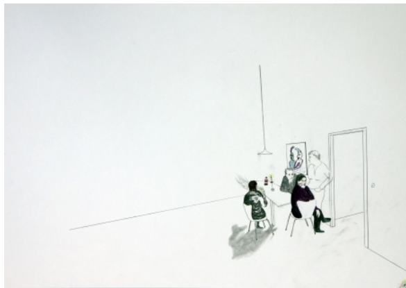
Family series 12, 2010 Drawing, 50x70