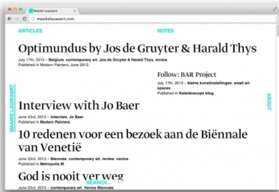
Maaïke Lauwaert, 2011 HTML, CSS, PHP, Javascript, Variable