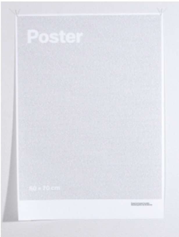
Poster, 2005 offset, 50x70