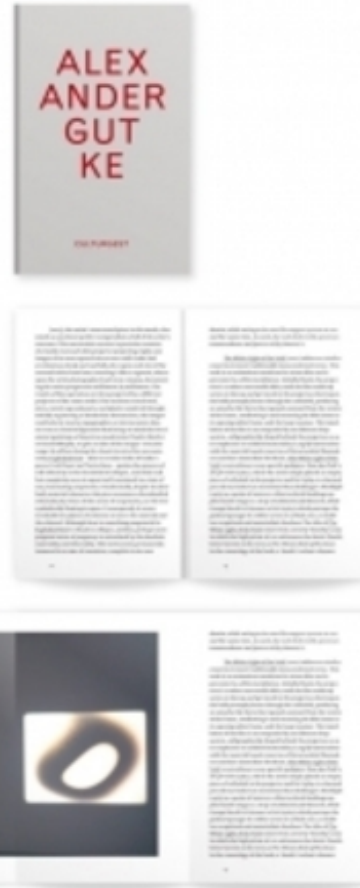
Alexander Gutke, 2011 Offset, 11.5x17.5cm