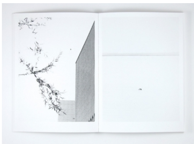
Jochen Lempert: spread, 2009 offset, 20×27.5 cm