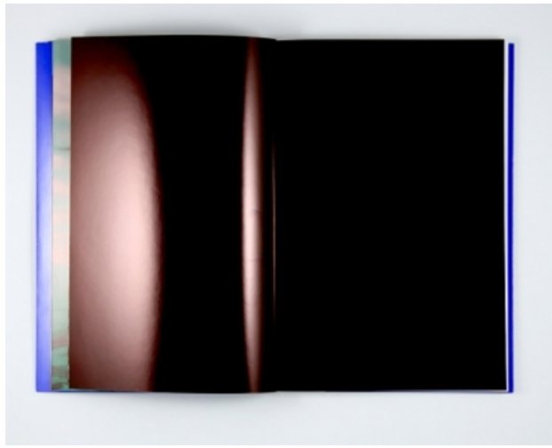
Miguel Soares: Spread, 2008 offset, 15.6×23.5