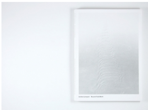
Jochen Lempert: Cover, 2009 offset, 20×27.5 cm