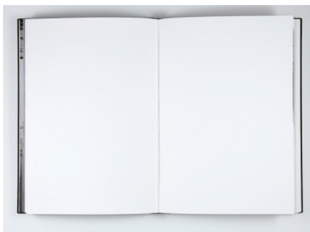
1+1+1=3, Spread, 2008 offset, 17×24