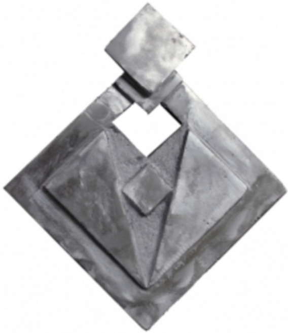
Object 1, 2016 Aluminium, 23x23x3