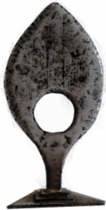
third eye, 2017 Aluminium, 30x10x6cm