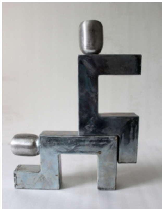
Duo 2, 2017 steel, 40x20x6cm