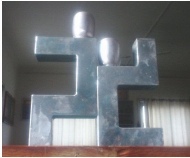
Duo 1, 2017 steel, 36x20x6cm