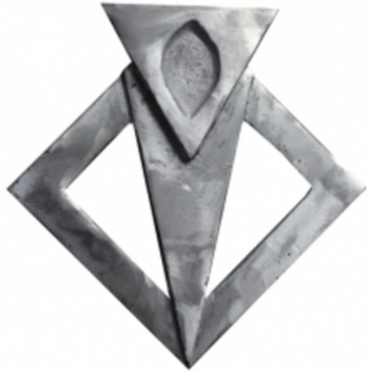
Object 2, 2016 Aluminium, 23x23x3