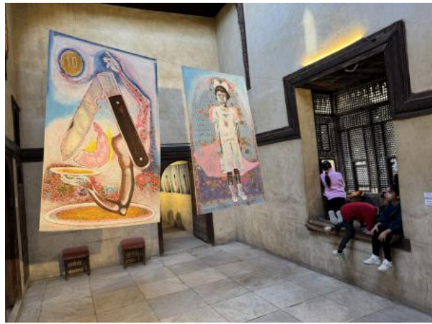
For that amount, he bowed like a penknife + Sewing fee: One guilder, 2024 oil/acrylics on artificial/factory java wax print, 180 x 120 cm. (double-sided)