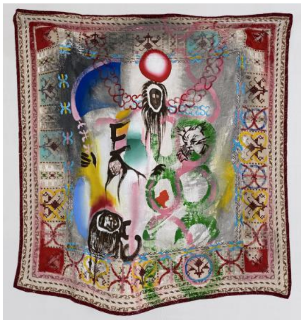
Dreaming of Home, 2022 Oil/acrylic/table cloth, 67 x 67