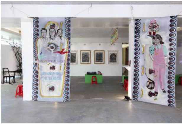
It's not the eyes that can't see, but the hearts that are blind - Pray for us (left), Children of God - Anak Tuan Allah (right), 2025 acrylic and oil on artificial Javanese waxblock print fabric, ±115 x 245 (double-sided)