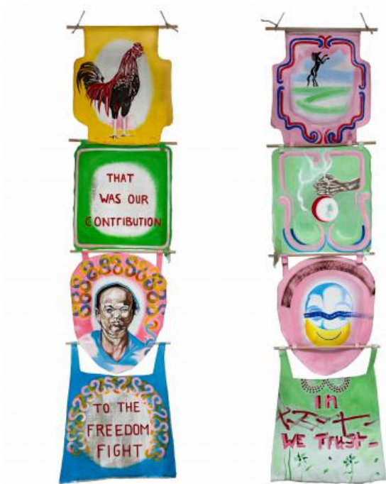
In roosters we trust, 2024 oil/acrylic/canvas, ± 200 x 50 cm. double sided