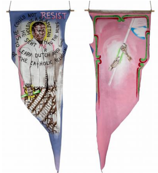
Resistance, 2024 oil/acrylic/canvas, ± 200 x 80 cm. double sided