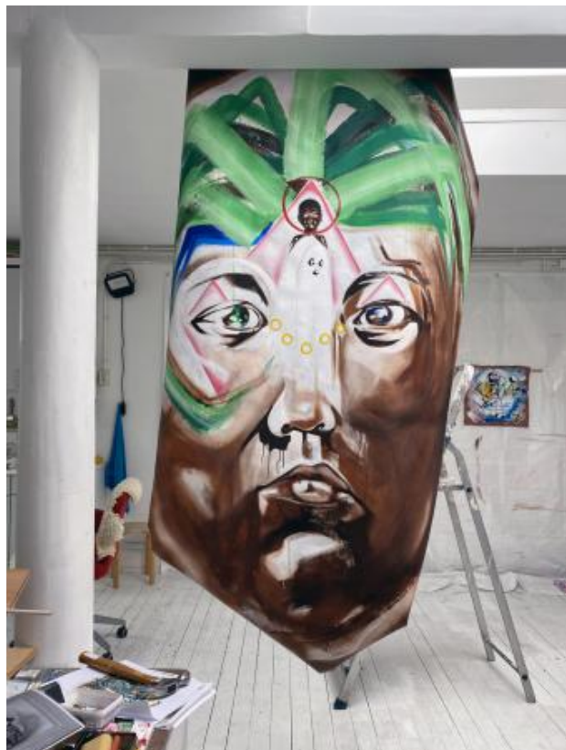
Head, 2022 2020-2022, canvas/oil/acrylic, 210 x 145