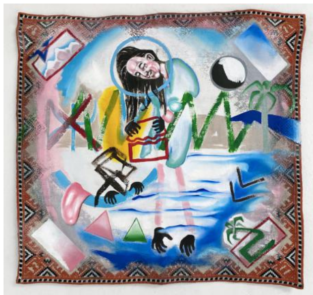
In search of, 2021 oil/acrylic/table cloth, 50 x 50