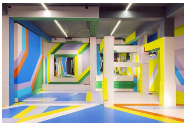
https://www.fotomuseumdenhaag.nl/nl/tentoonstellingen/enterIn Situ, 2023 cube, 2025