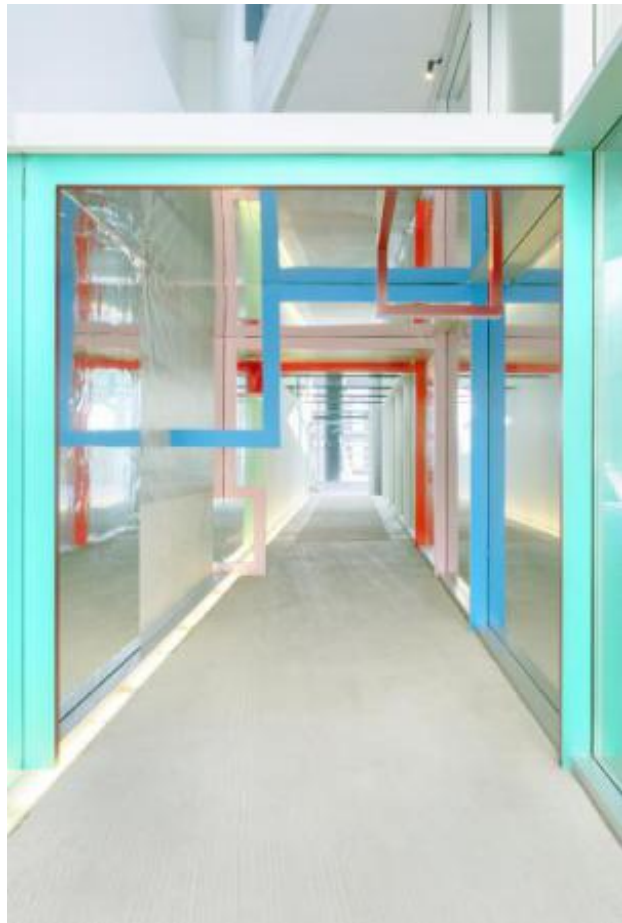
installation Isomatrix , 2021 various, 12 x 5 x 4 m