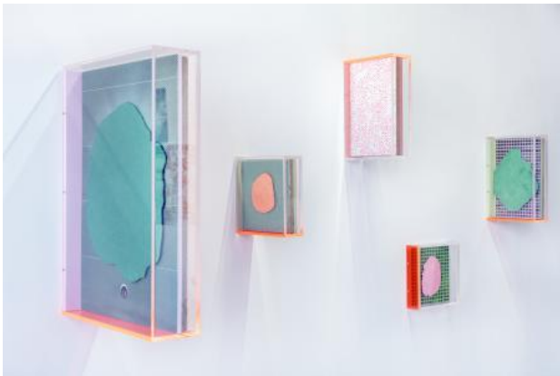
Ongoing Series of False Ceilings, 2023 Ongoing Series of False Ceilings, diverse