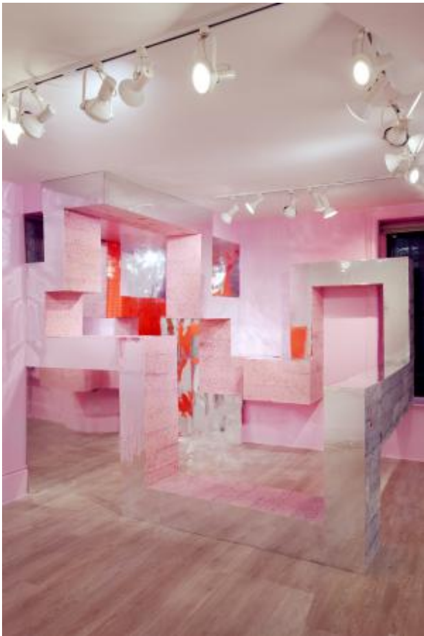
Radical Interventions, 2023 photoprints and cardboard, 5 x 5 x 8 metre