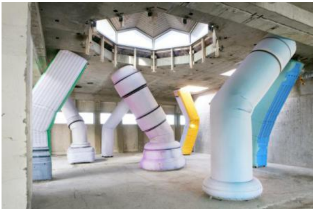
Installation view Big Art, 2022 photoprint on fabric, 600 x 700 x 400 cm