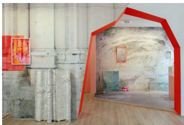
https://www.fotomuseumdenhaag.nl/nl/tentoonstellingen/enterh cube, 2025