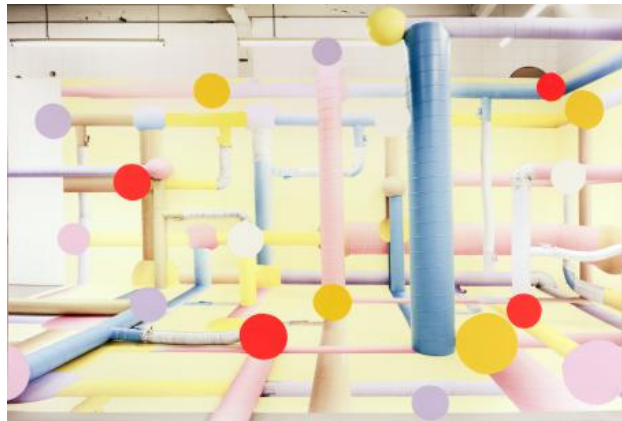
Interior no. 67, 2022 Ultrachromeprint with plastic oil, 140 x 200 cm