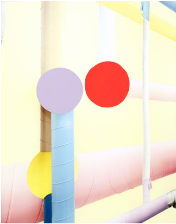
Interior no. 66, 2022 Ultrachromeprint with plastic foil, 32 x 40 cm