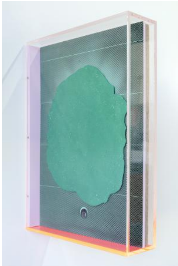
Ongoing Series of False Ceilings no.3, 2023 plaster, False ciling plates, wood, photoprints and plexiglass, 42 x 60 x 12 cm