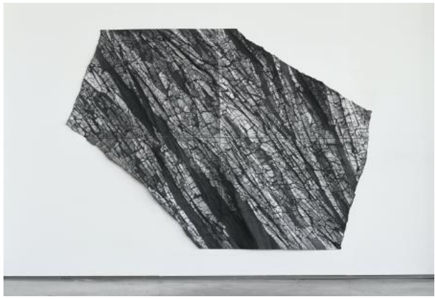
Rough Cut No. 1, 2021 graphite on paper on foil , 140 x 200 cm