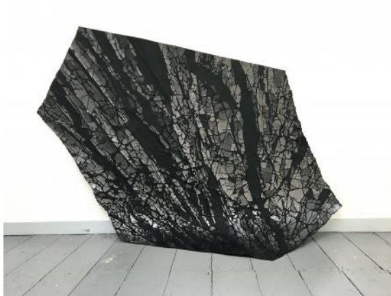
Rough Cut No. 2, 2021 graphite on paper on foil, 140 x 220 cm