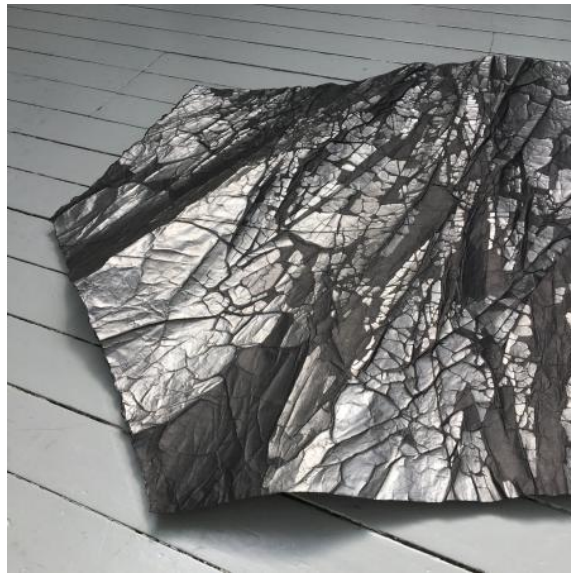
Rough Cut No. 3, 2022 graphite on paper on foil, detail