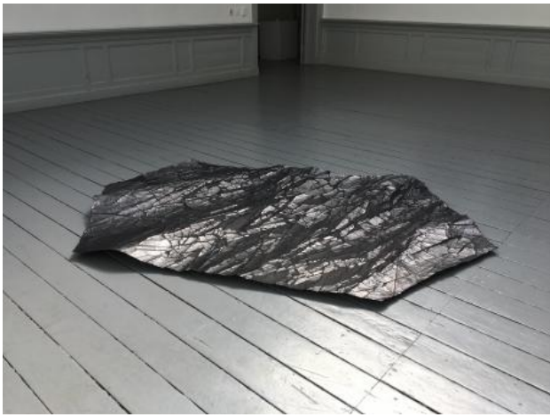
Rough Cut No. 3, 2022 graphite on paper on foil, 140 x 235 cm