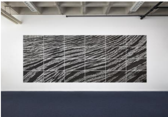
Other Orebody, 2020 graphite on paper on foil, 503 x 191 cm