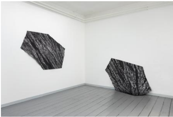
Rough Cut No. 1 (left) and Rough Cut No. 2 (right), 2021 graphite on paper on foil, 140 x 200 cm and 140 x 220 cm