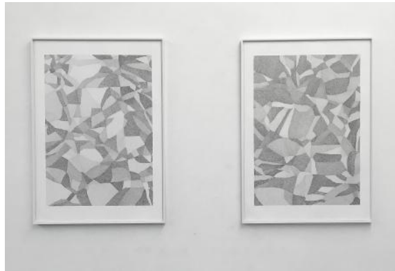
Current Knowledge, 2022 pencil on paper, each drawing 83 x 59 cm