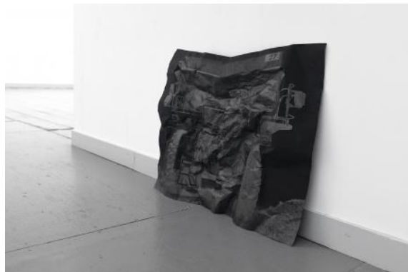
Komatsu Krumple, 2022 silkscreen on paper on foil, 50 x 65 cm