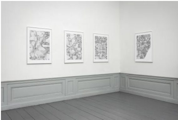
Current Knowledge, 2022 pencil on paper, each drawing 83 x 59 cm