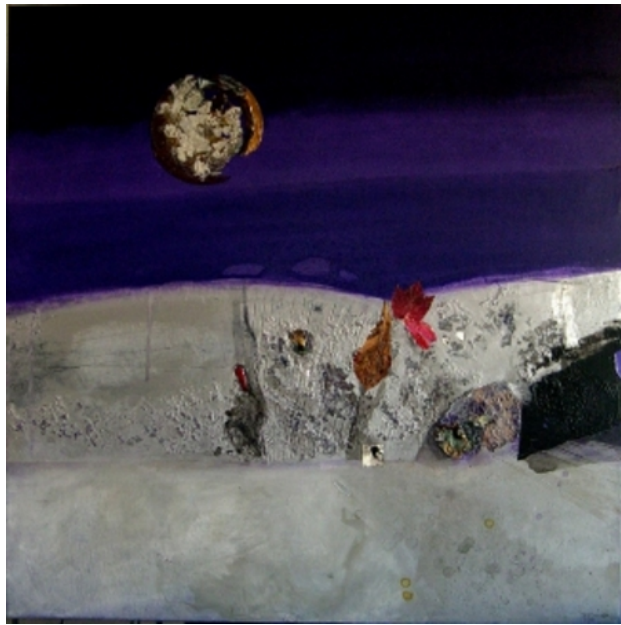
Landscape, 2006 Oil on Canvas, 100x100