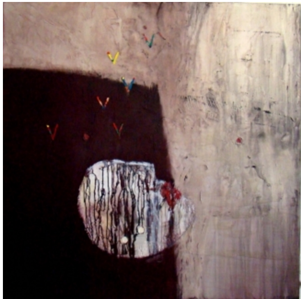
Untitled 2, 2008 Mixed Media on Canvas, 150x150

-- Ingrid Rollema The Hauge, The Netherlands