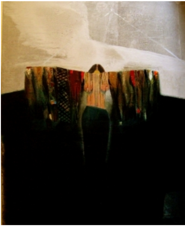
Sacrifice, 2006 Oil on Canvas, 130x160