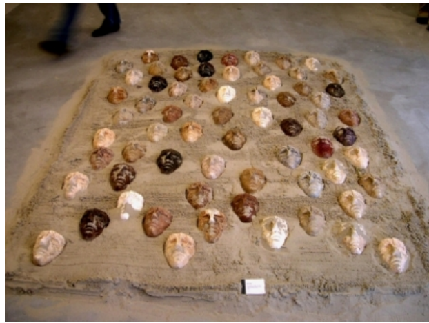
To whom it may concern, 2004 Terracotta and sand, 180x220