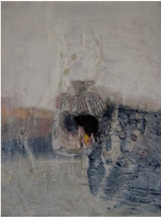
Detail 2, 2004 Mixed Media on paper, 56x76