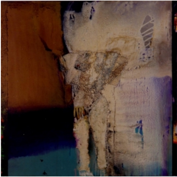
Explosion, 2002 Oil on Canvas, 100x100