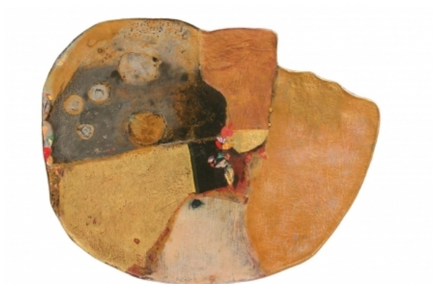
Out of...., 2007 Mixed Media on Canvas, 80x100