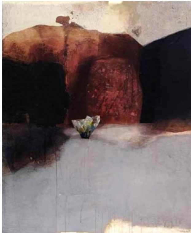
Untitled, 2004 Oil on Canvas, 130x160