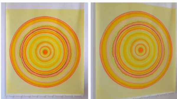
Like Earth; warm up a few degrees and let your ice ..., 2025 oil pastel on paper, 157 x 170 cm