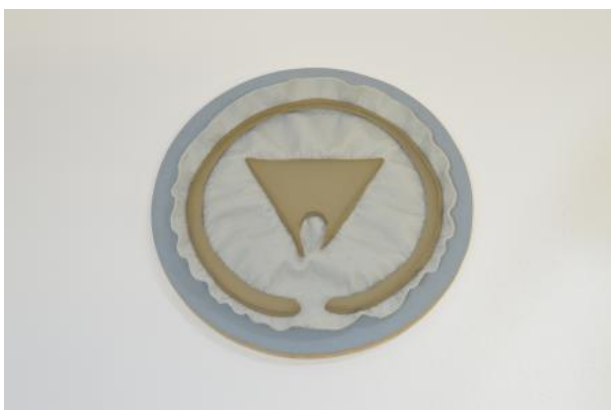
Yield S 06, 2020