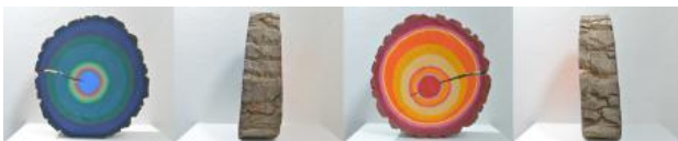
1AU (astronomical unit), 2020