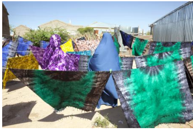
Women's cooperative, 2018