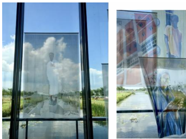
Ode to Youthfull Daredevils, 2020 Installatie zijden, 4 x 12 mtr