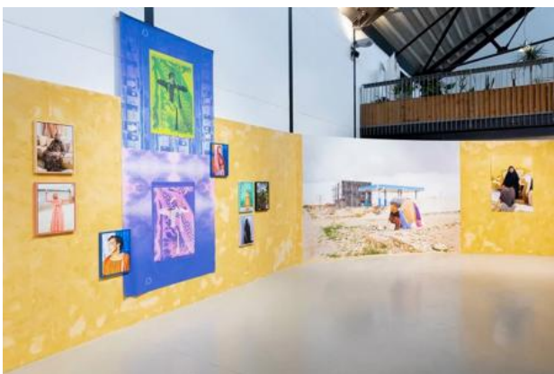
People Made of Stories, 2025 Installatie, fotografie, textiel