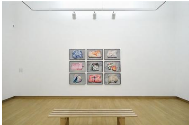
The Floating Population, 2018