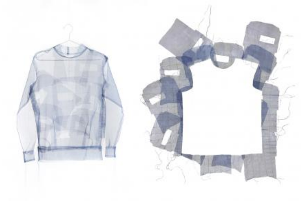
Frisse Start, 2025 naai en handwerk, 2x3 mtr