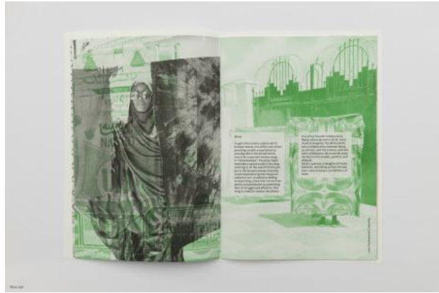
Baati as Archive, 2025 zine