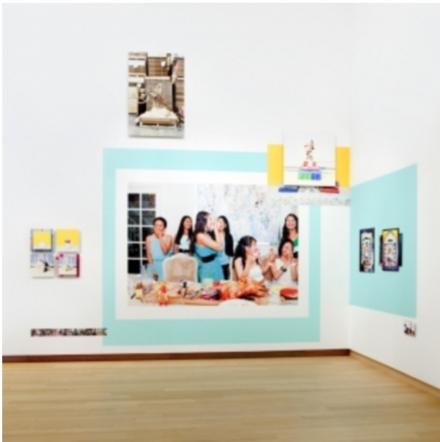
A Nation Outside A Nation, 2015 verschillende, 4x7