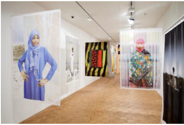
Ode to Youthfull Daredevils, 2019 Installatie zijden, 4 x 12 mtr