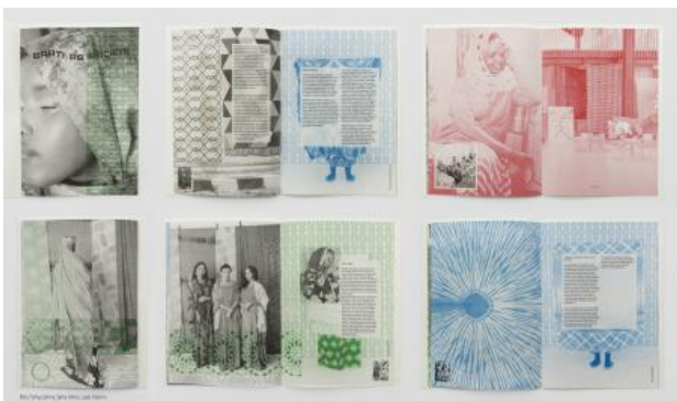
Baati as Archive, 2025 zine