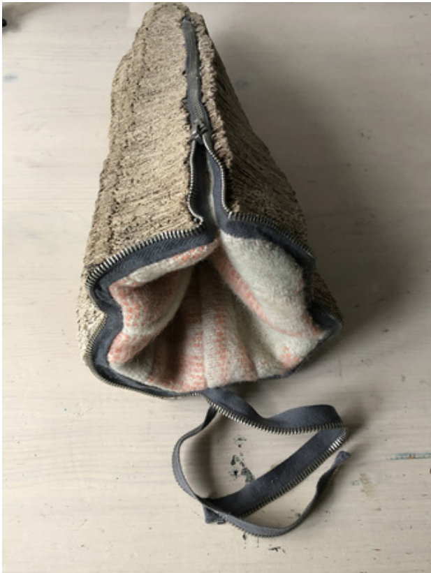
no title, 2020 mixed media, 40 x 20 x 13 cm