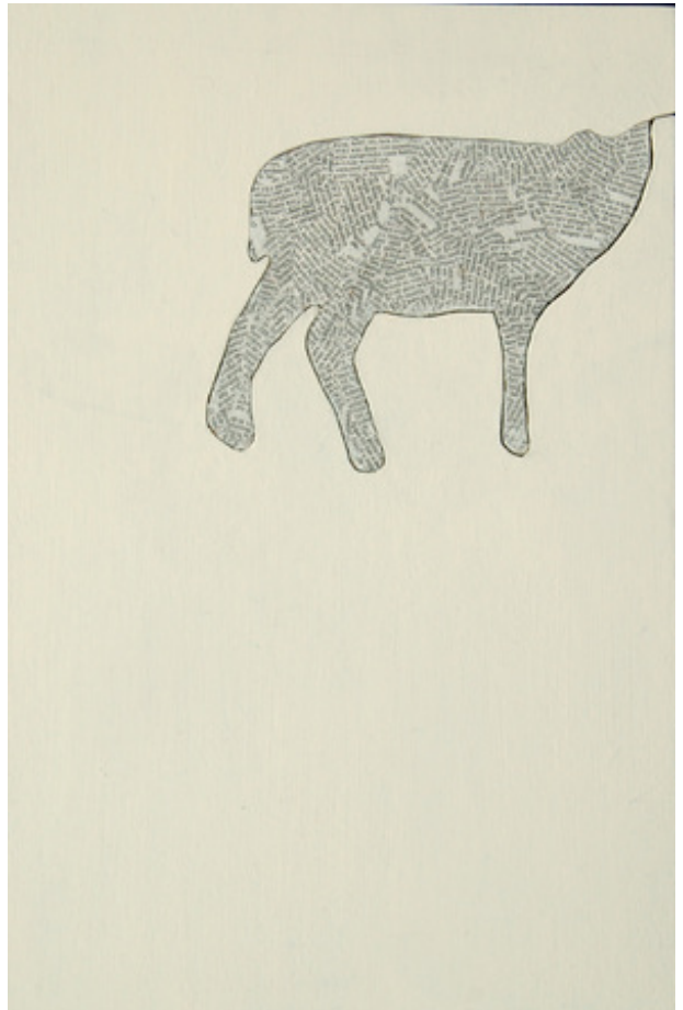
deer 2, 2019 mixed media, 30 x 20 cm