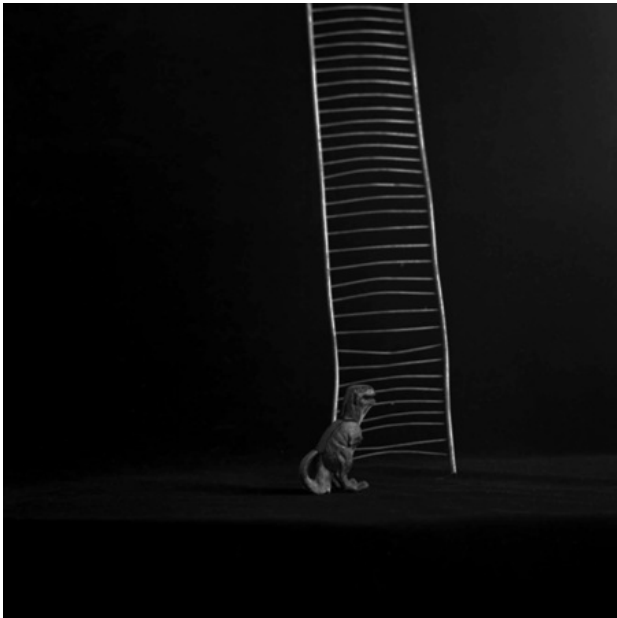
no title, 2018 black /white photo, analog, 40 x 40 cm