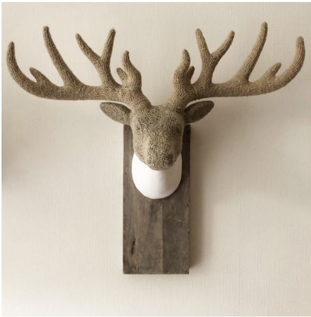
Deer 3, 2020 mixed media, 45 x 48 x 20 cm