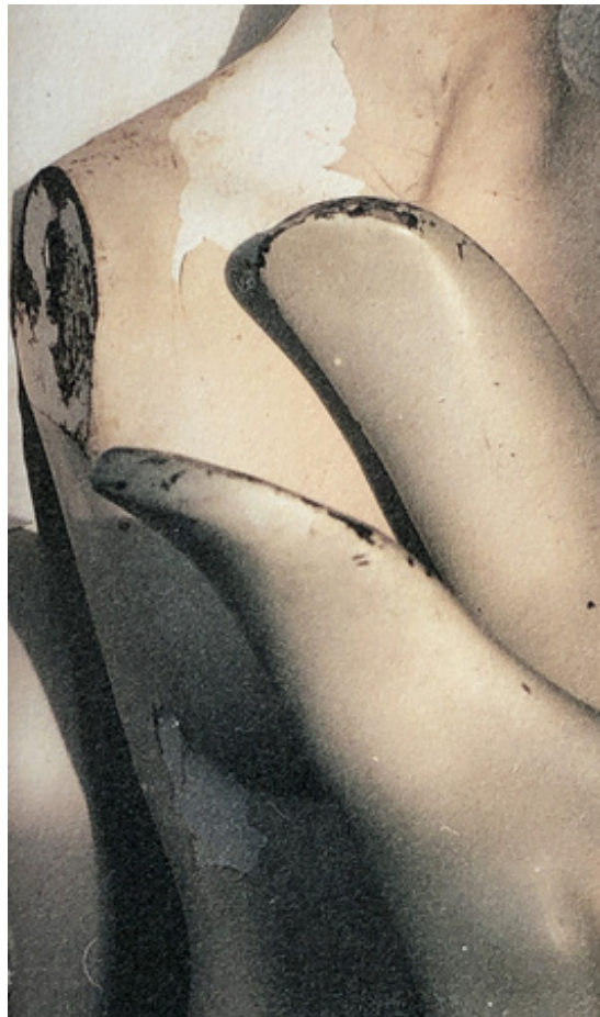
no title, 2019