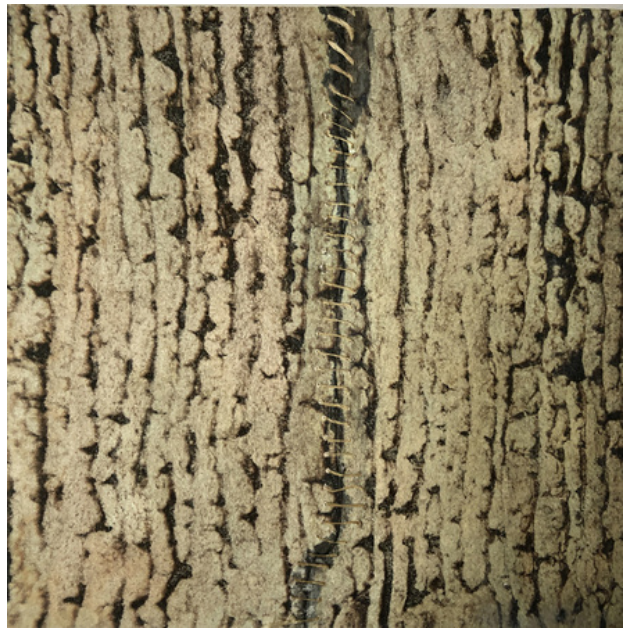
no title, 2020 mixed media, 15 x 15 cm