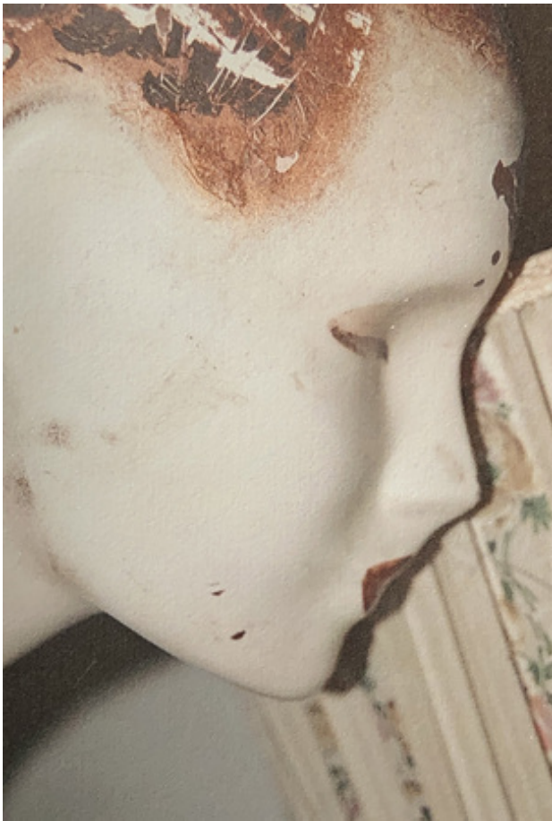
no title, 2019