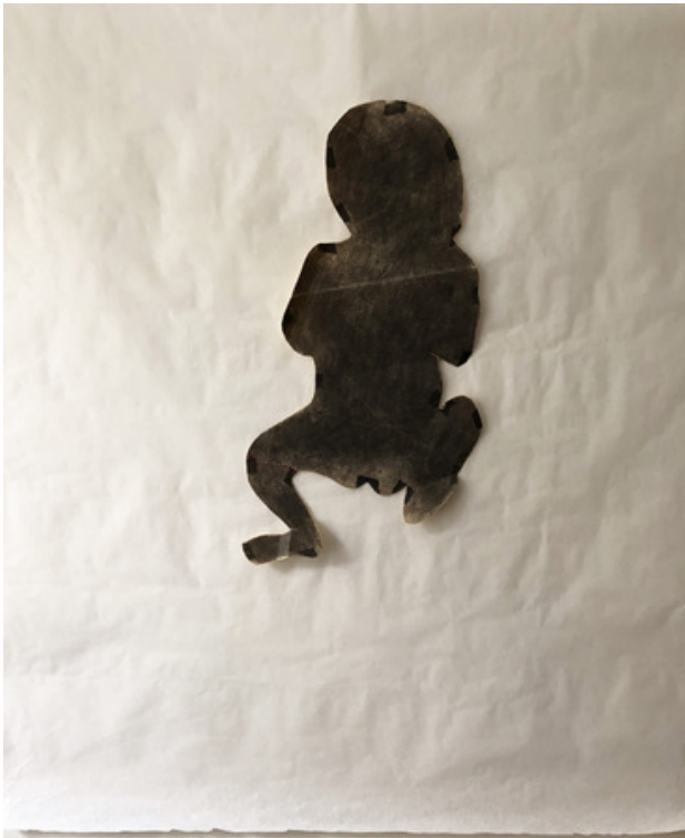
no title, 2019 mixed media, 120 x 100 cm