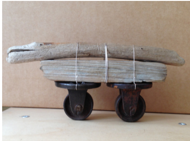
no title, 2018 metal, wood, silver, 15 x 8 x 2 cm