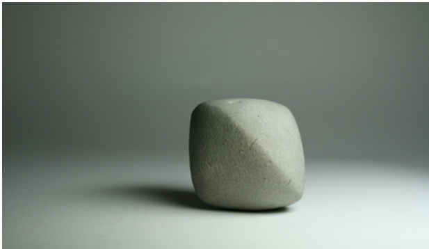
still leven, 2019