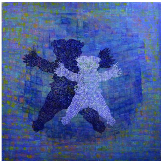
Knuffel, 2022 Oil on doek, 200x200x10cm