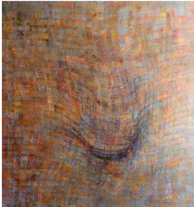
imapct03, 2020 olie op doek, 2mx2m