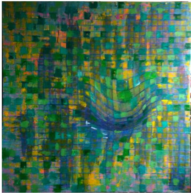
imapct02, 2020 olie op doek, 2mx2m