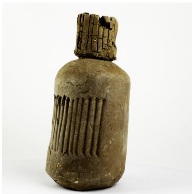
aarde, 2022 aarde, 4cmx4cmx9cm