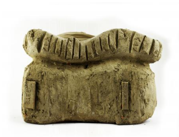
staal, 2022 kleiwerk en fotografie