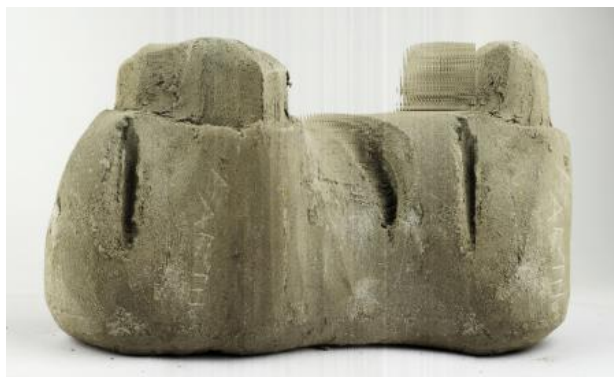
EARTH, 2022 kleiwerk en fotografie