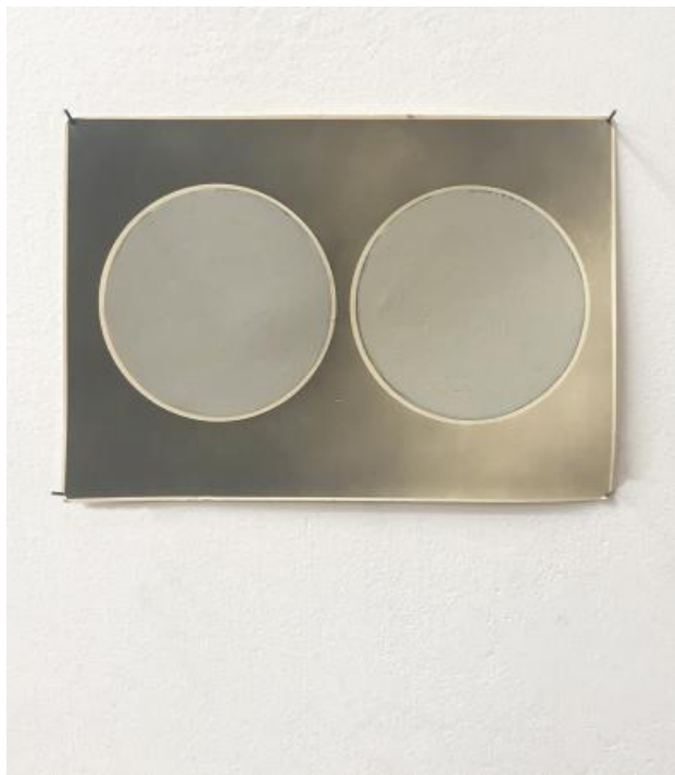
double portrait of a circle, 2023 acrylic paint on paper, 10 x 15 cm