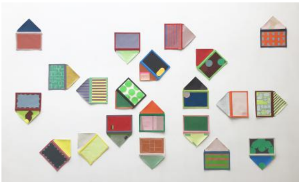
21 happy envelopes, 2024 mixed media on paper envelopes, 200 x 210 cm