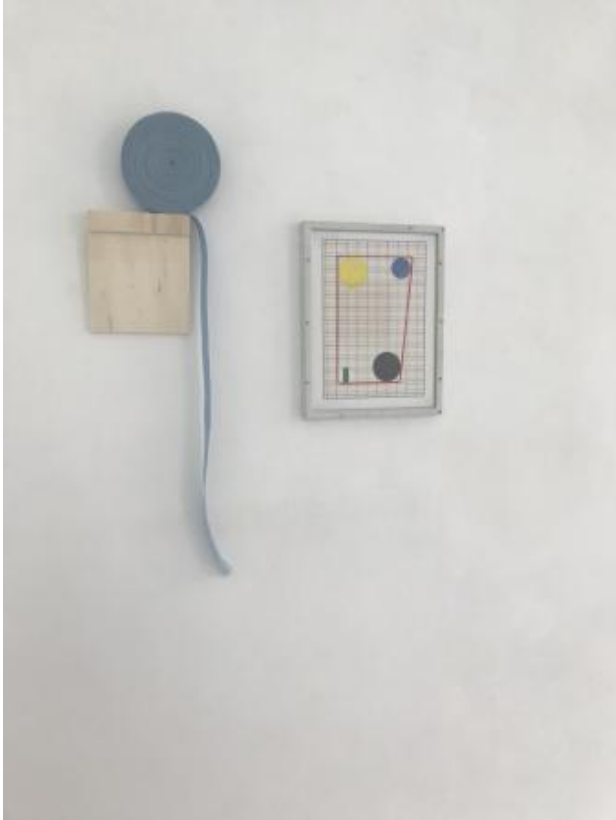
juxtaposition, 2024 mixed media/ marker - sticker drawing, 36 x 30