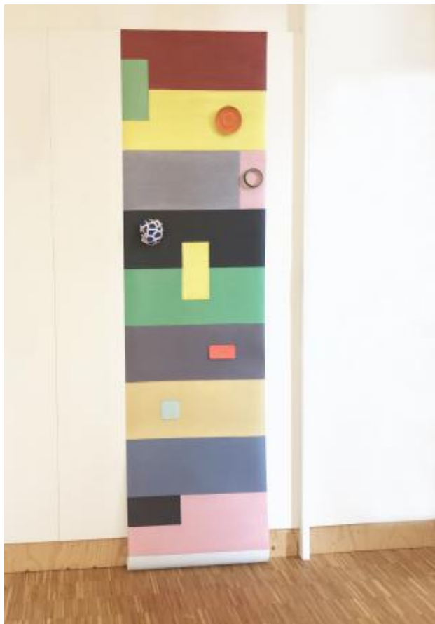
wall paper design by AML for Stdio DNNK, 2022 mixed media, 300 x 80 cm