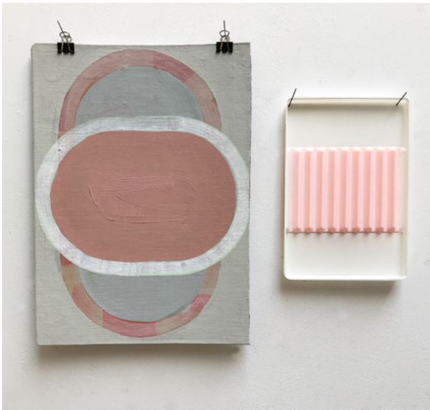
DUO, 2020 oil painting on the left, plastic object on the right, 25 x 20 cm