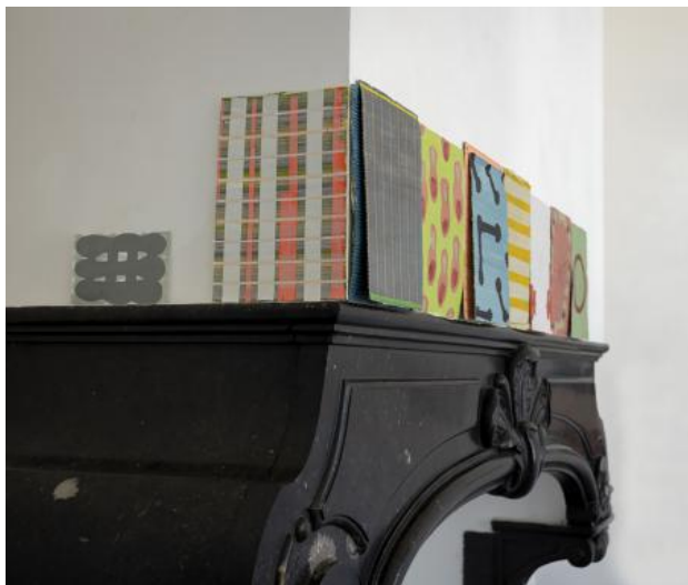
robe bleu, fond rouge, 2021 acrylic on paper