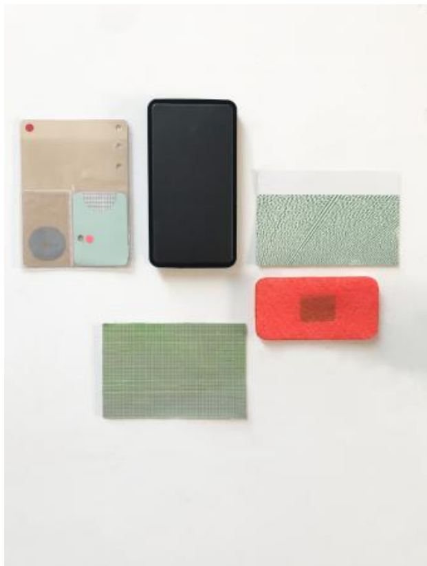
quintet, 2022 mixed media, 50 x 50 cm