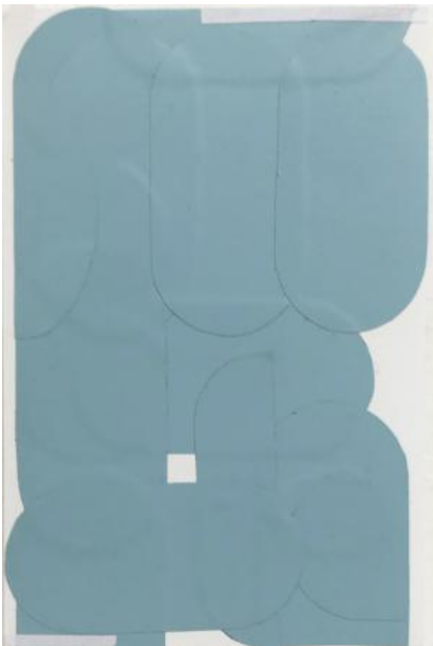
untitled, 2023 collage, 15 x 10 cm