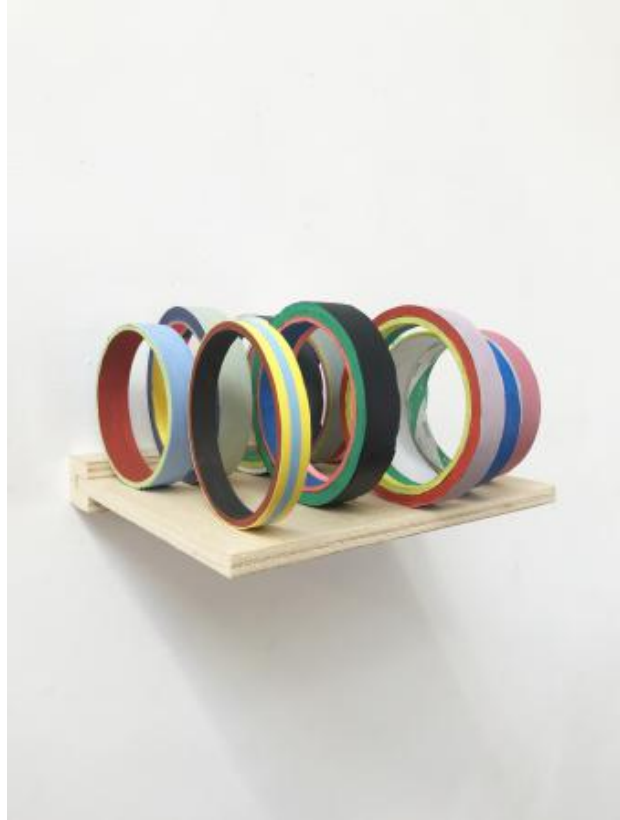
fake tape object, 2024 acrylic paint, 20 x 20 x 15 cm