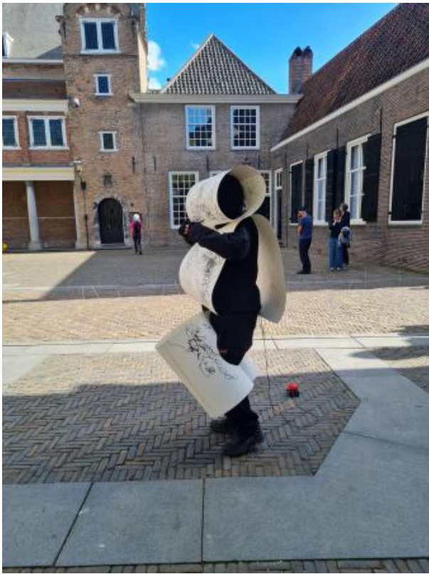
Walk, listen and draw, 2025 performance