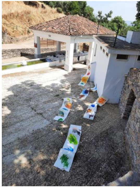
Weaving sounds and signs into moving traces, 2025 acrylic, marker and local soil on cardboard, 5x 280x55 cm