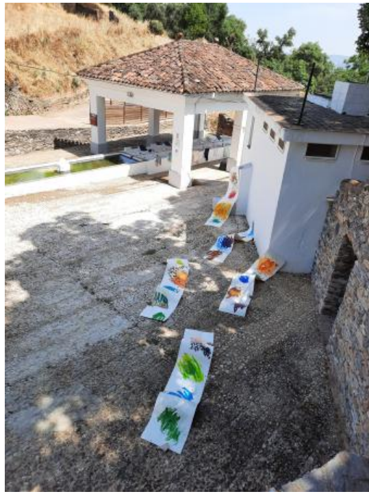
Weaving sounds and signs into moving traces, 2025 acrylic, marker and local soil on cardboard, 5x 280x55 cm