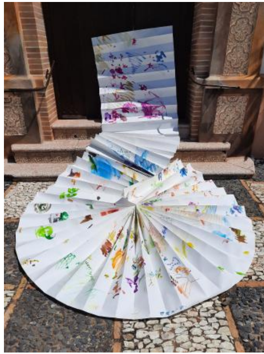
Working Title: The Dress, 2025 variation of drawing and painting techniques, gouache, acrylic, plant-based paint, dried flowers, 10x1000cm