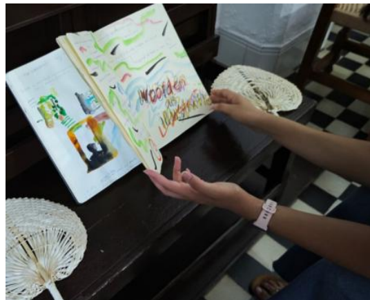
The Fifth Book, 2025 fountain pen, and div. drawing materials, 30,5x22cm size book