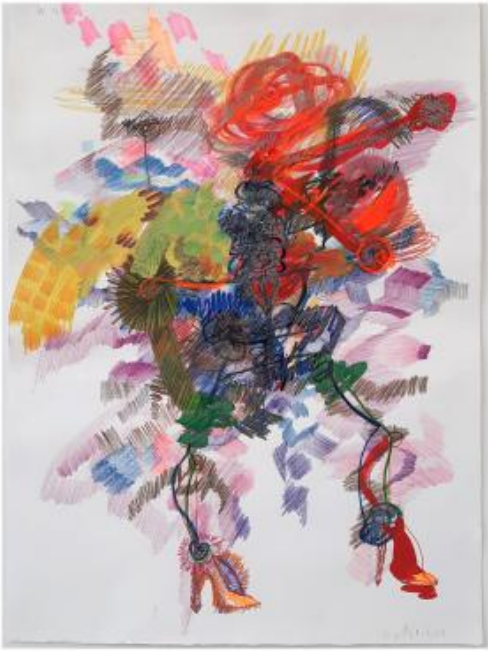
Sois belle et tais-toi (waiting for the other context), 2024 Gouache, colored pencil, multicolor pencil, pencil, marker on watercolor paper., 77x56,5cm