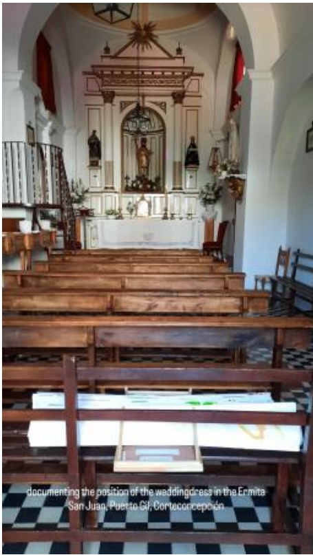
documenting the position of the wedding dress in the Ermita San Juan, Puerto GI, Cor te concepción