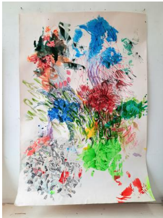
Zoekogen, 2025 a variation of drawing and painting materials, 181x124cm