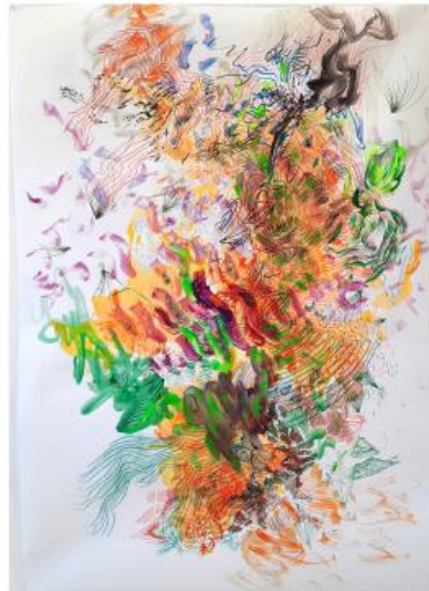
Moving inside the dress, 2025 Acrylic, (multi)colourpencil, markers on white cardboard, 178x122cm