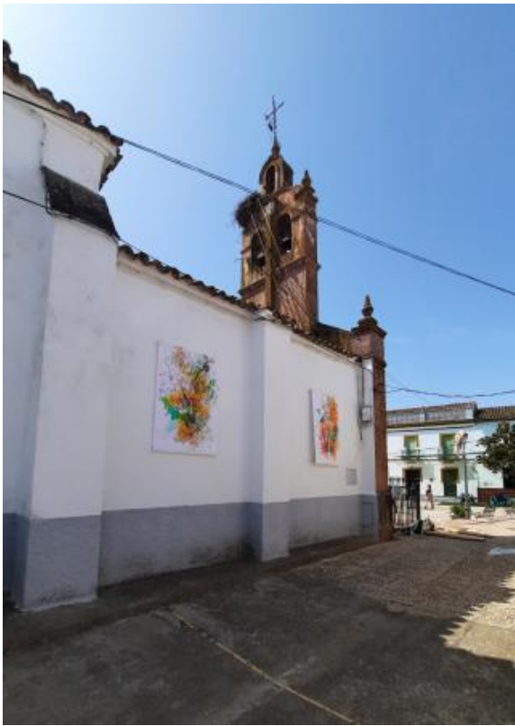
part of the exhibition Brota el Pueblo, 2025 acrylic, marker, pencil on cardboard, each 178x122 cm