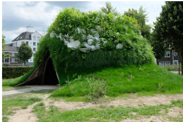
Bee Embassy, 2022