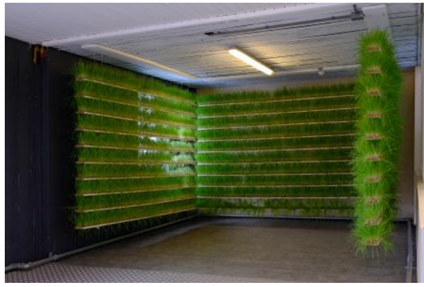
Lux-Flex, 2022 sprouts, 3x3x3