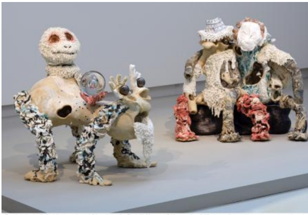
'Couple in love with dog', here on show at & bought by, the Stedelijk Museum 'S-Hertogenbosch NL. An installation with two big ceramics works and - a crystal ball that enlarges and reduces at the same time -. Created from a variety of ceramic materials and techniques but however fired as one. The work deals about the outer and inner aspects of falling in love and embraces shamanism, with a blink to Hieronymus Bosch.