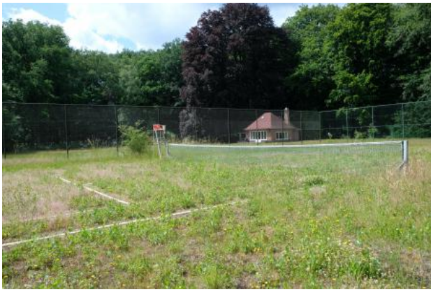
'Lawn Tennis' in the artshow Pioneers at former Royal Palace Soestdijk, 2022 reatauratie // nature conservation, tennis court