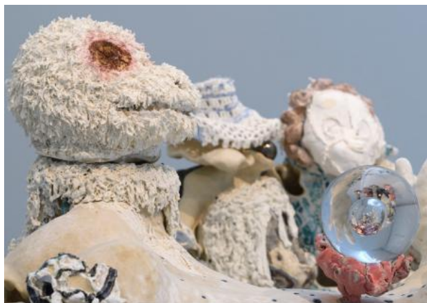
'Couple in love with dog', the dog part.