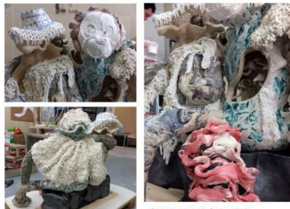
'Couple in love with dog', the Couple part, details