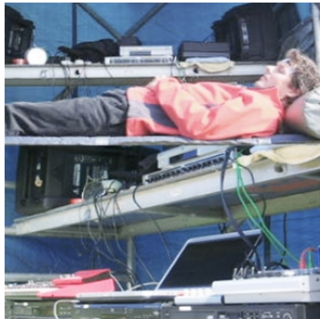
Het bewustzijn van een park, 2004 Geluidsperformance/installatie, 40000x20000