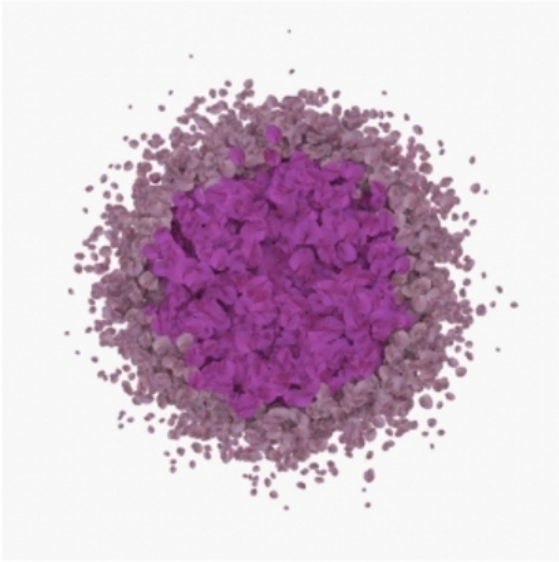
Vallende bladeren (Bougainville), 2008 photographic print on dibont, framed, 112x112