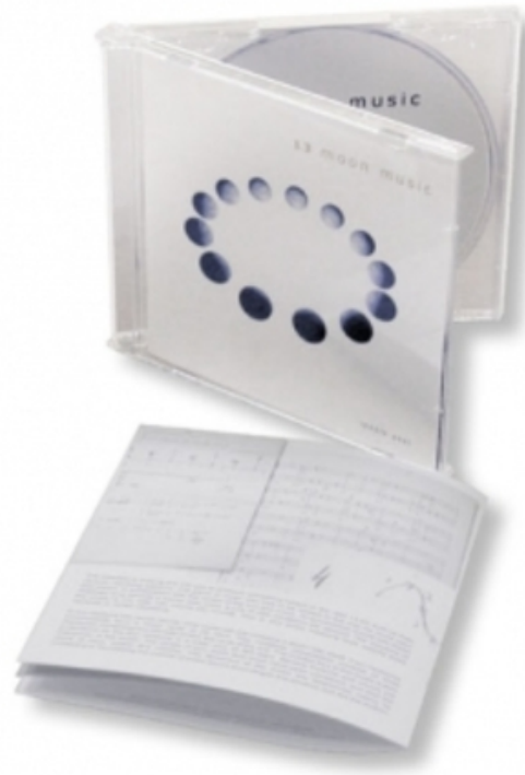
13 Moon Music, 2006 Audio cd + boekje, nvt