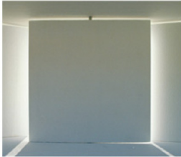
Equator #35, 1998 fotografie, 40x45