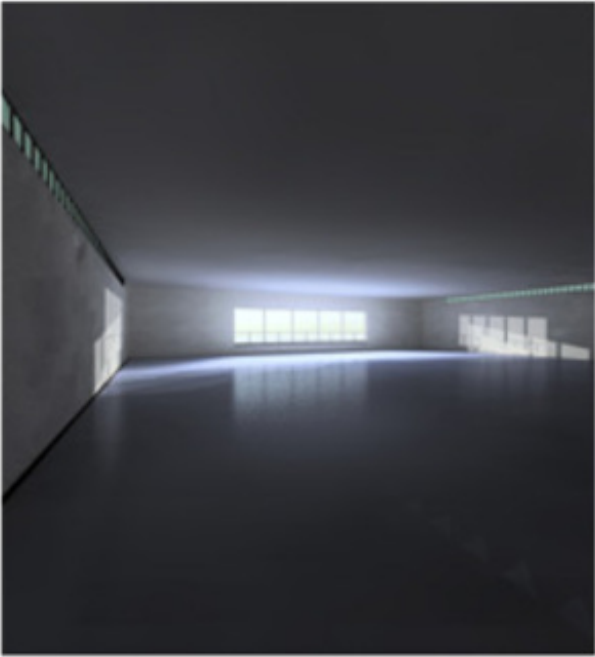
langste dag in de studio, 1999 cgi, 90x90x110